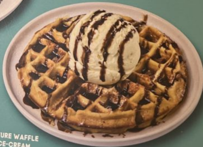
SIGNATURE WAFFLE WITH ICE-CREAM

ALL PRICES ARE SUBJECT TO 10% SERVICE CHARGE AND 9% GST. IMAGES SHOWN ARE FOR ILLUSTRATION PURPOSES ONLY TERMS & CONDITIONS APPLY