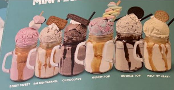
BERRY SWEET SALTED CARAMEL CHOCOLOVE GUMMY POP COOKIE TOP MELT MY HEART