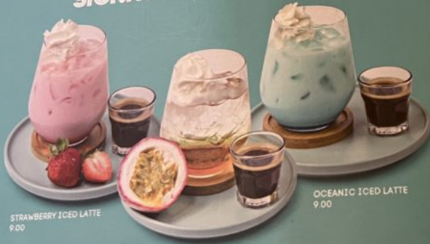
STRAWBERRY ICED LATTE 9.00