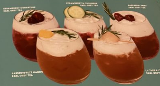
STRAWBERRY GORGONZOLA EARL GREY TEA