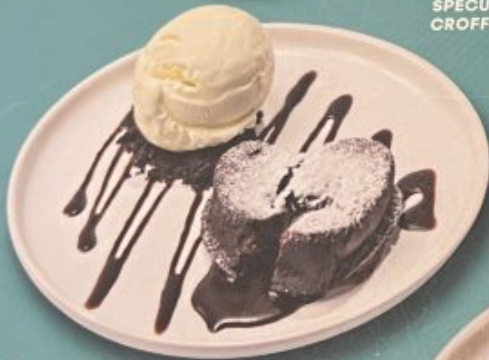
MOLTEN CHOCOLATE LAVA CAKE