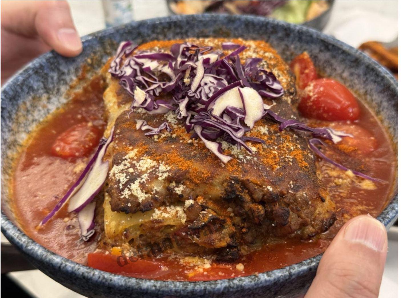
This was Wilber's choice for the night.