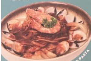
TON YUN SEAFOOD PASTA

CHICKEN STEAK-OUT 13.9 GRILLED TO PERFECTION, OUR succulent CHICKEN STEAK IS ACCOMPANIED BY A SIDE OF GOLDEN FRENCH FRIES, SEASONAL VEGETABLES AND SAUTÉED MUSHROOMS TOSSED IN SESAME SOY SAUCE SERVED WITH OUR HOMEMADE BROWN SAUCE