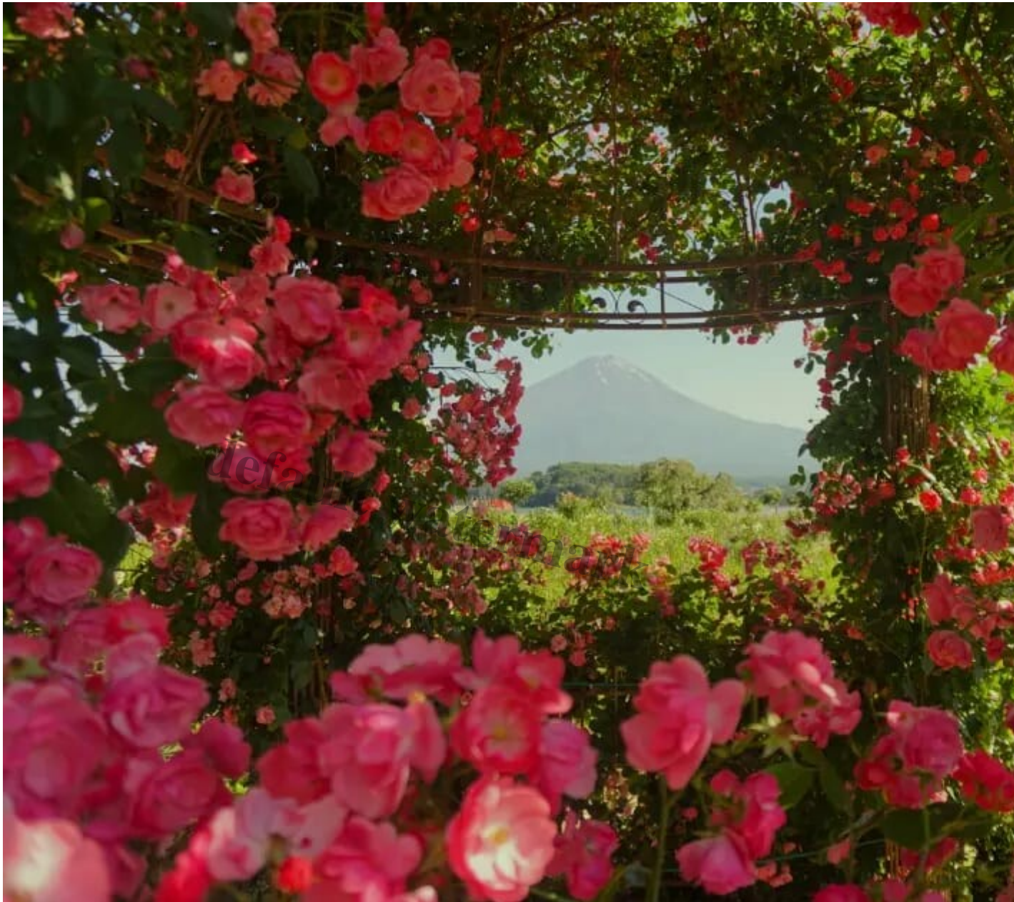
Summer: vibrant matsuri, fireworks, and lush greenery.