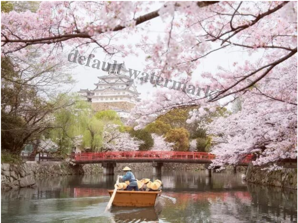
Spring: cherry blossoms, plum blossoms, and colourful blooms across Japan. Image: JNTO

Submissions are organised into five categories, reflecting Japanâ??s distinct beauty across its four seasons â?? plus a video category for those who prefer to let motion tell the story.