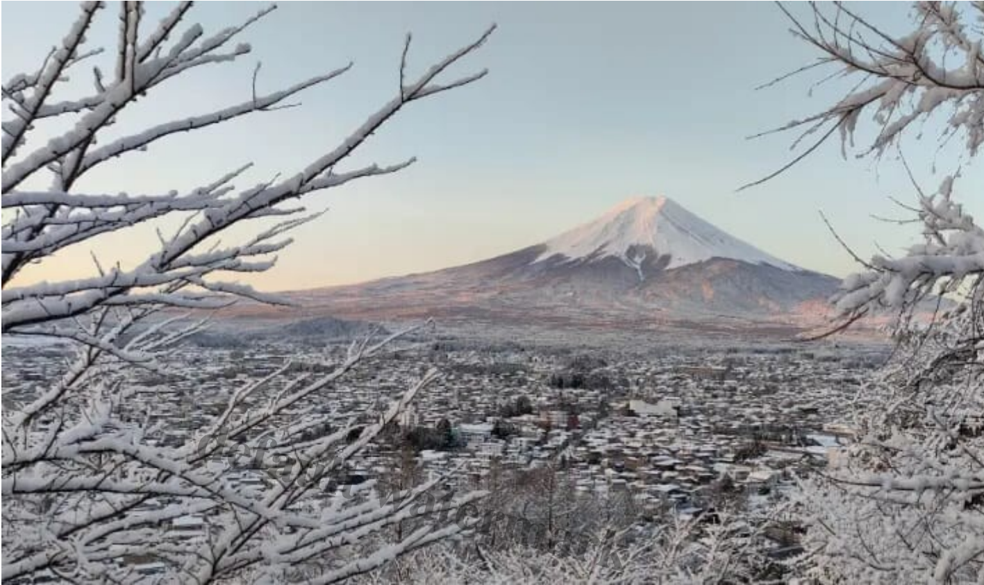
Winter: glistening snowscapes, winter festivals, and nighttime illuminations.

For the Video Category , the brief is equally evocative: let Japan's landscapes breathe, and share the country in motion.