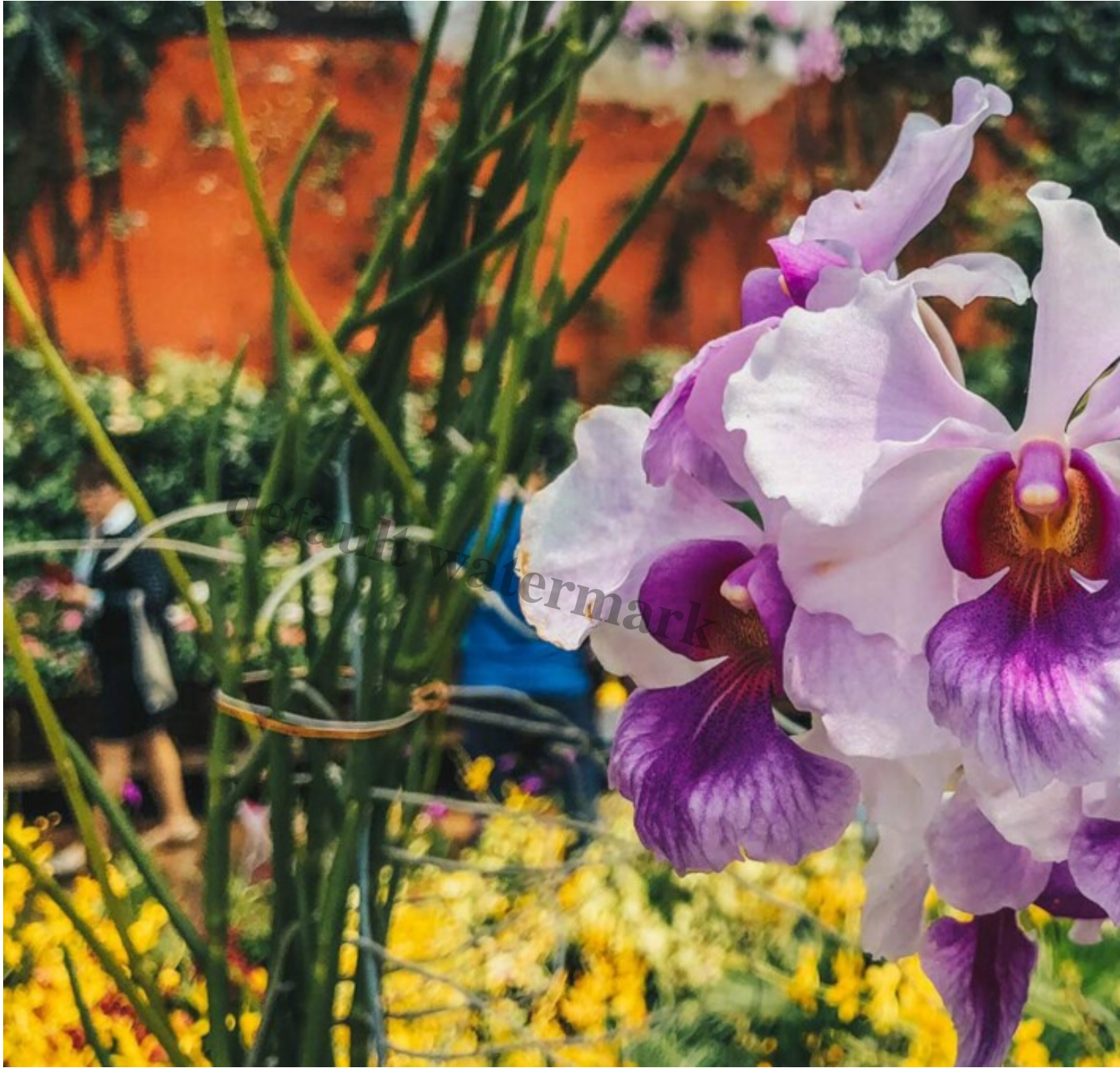
Gardens by the Bay horticultural display image.