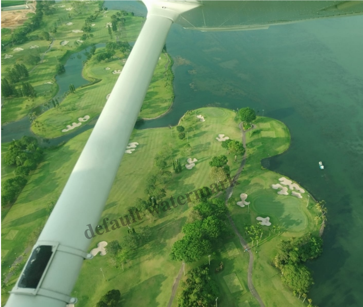
Overlooking a golf course that looks miniature from above

Join me as I post some pictures of my adventures from my little aeroplane.