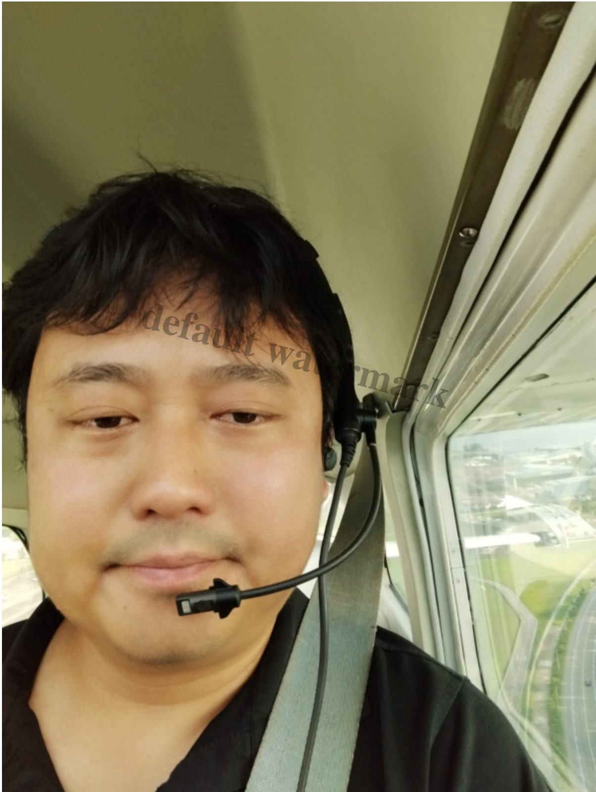
Serenade by the views