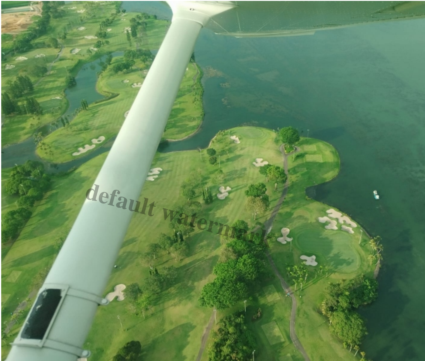
Overlooking a golf course that looks miniature from above

Join me as I post some pictures of my adventures from my little aeroplane.