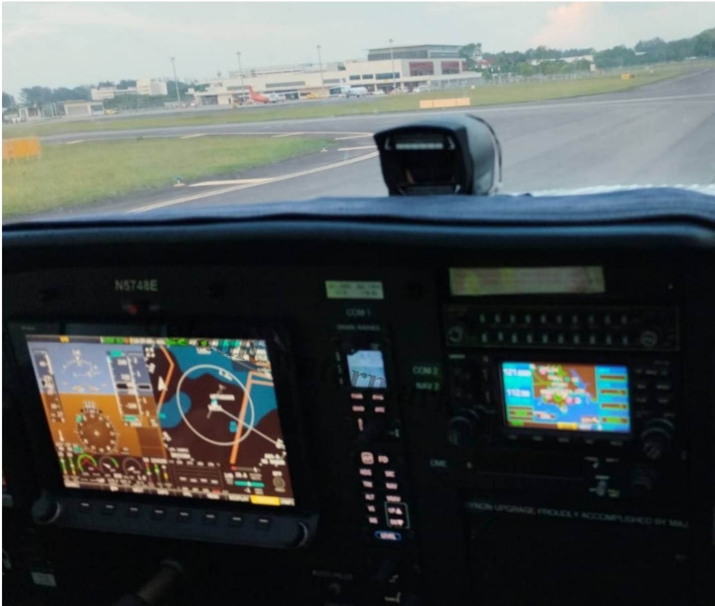
Understanding your avionics is key to a smooth flight