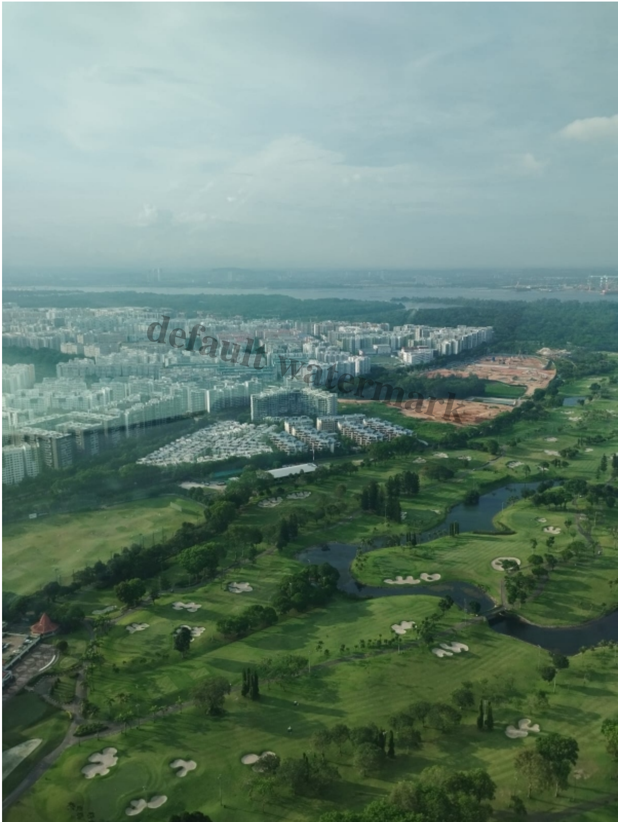
One of the wonders of the world: To squeeze so much housing in so little land