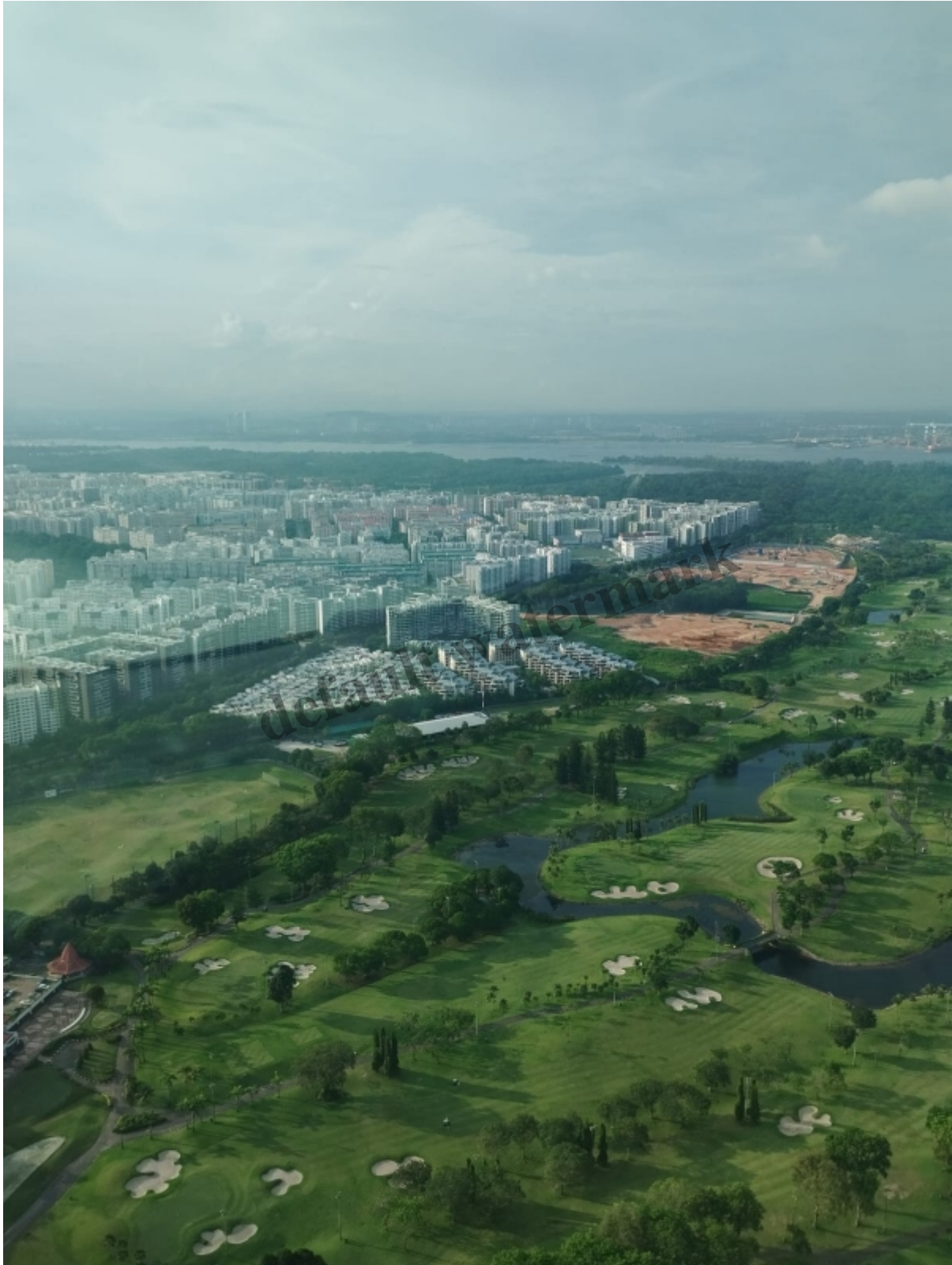
One of the wonders of the world: To squeeze so much housing in so little land