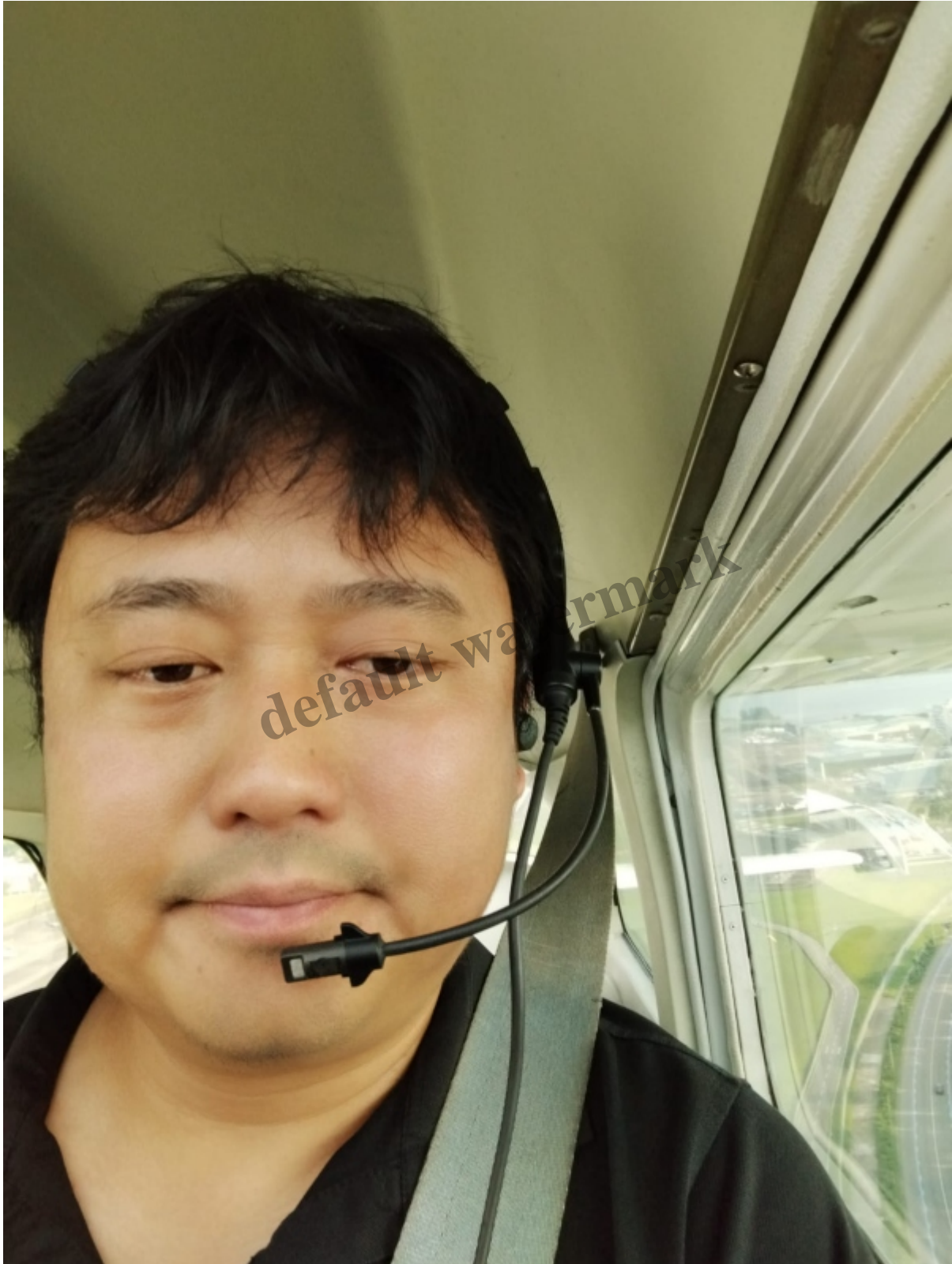
Serenade by the views