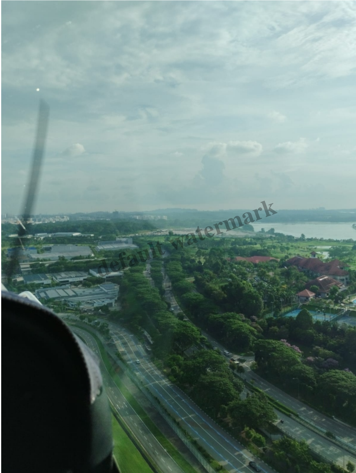
With such view, it is hard to say no to flying