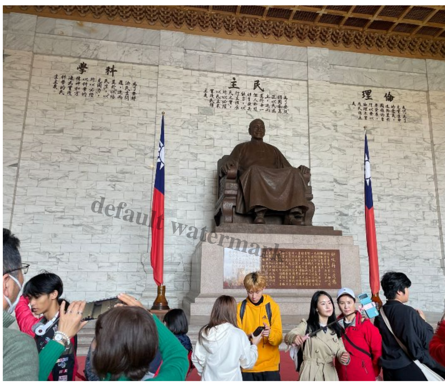
Chiang Kai-shek Bronze Statue