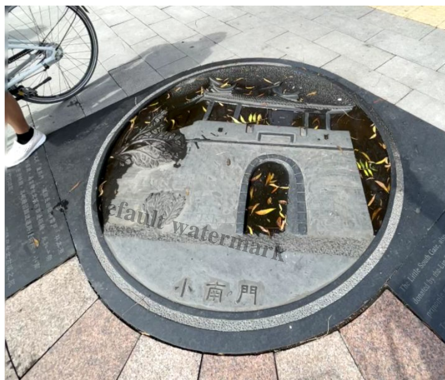
Carving of The Little South Gate (Chongxi Gate)