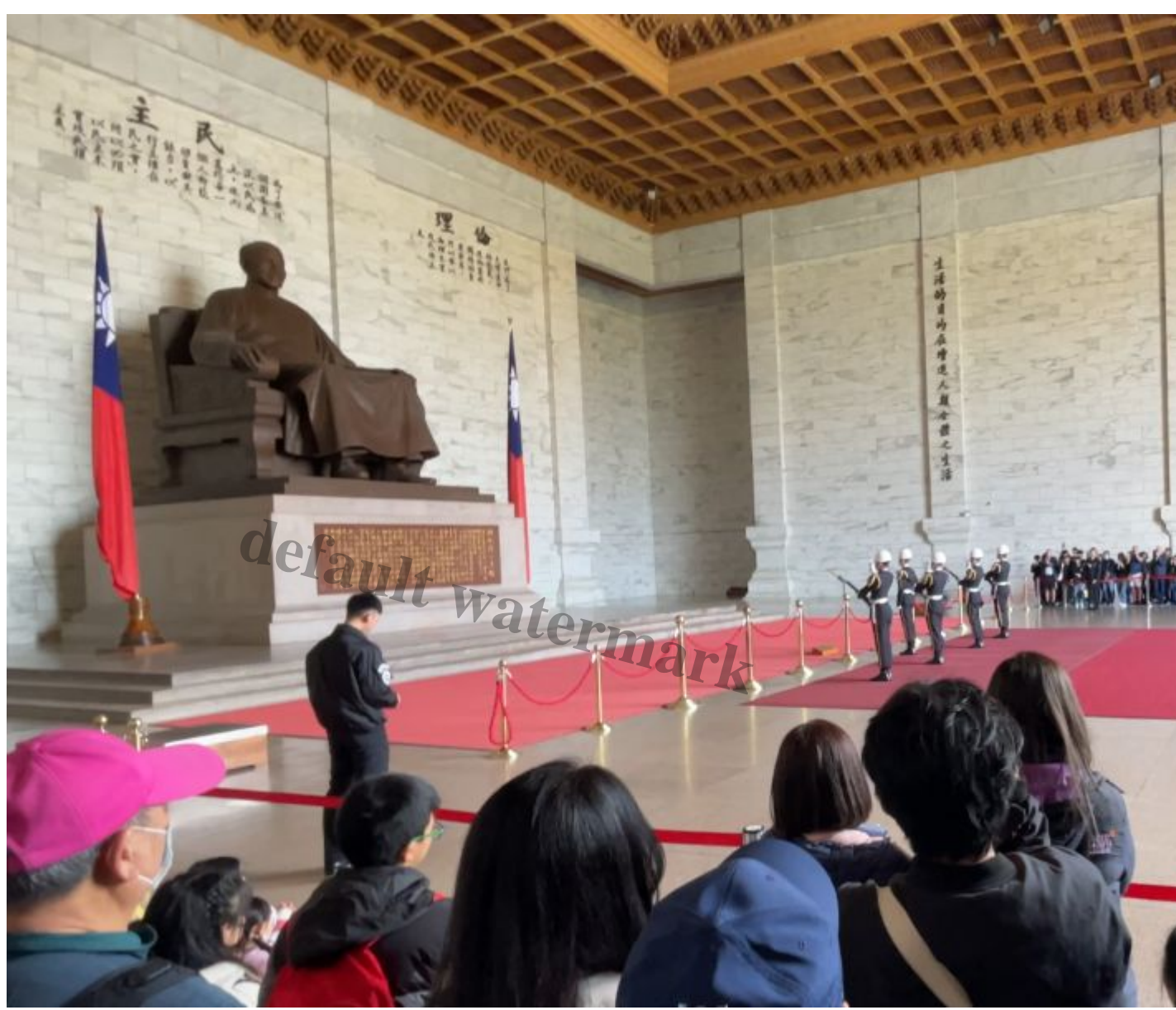
Change of guard ceremony