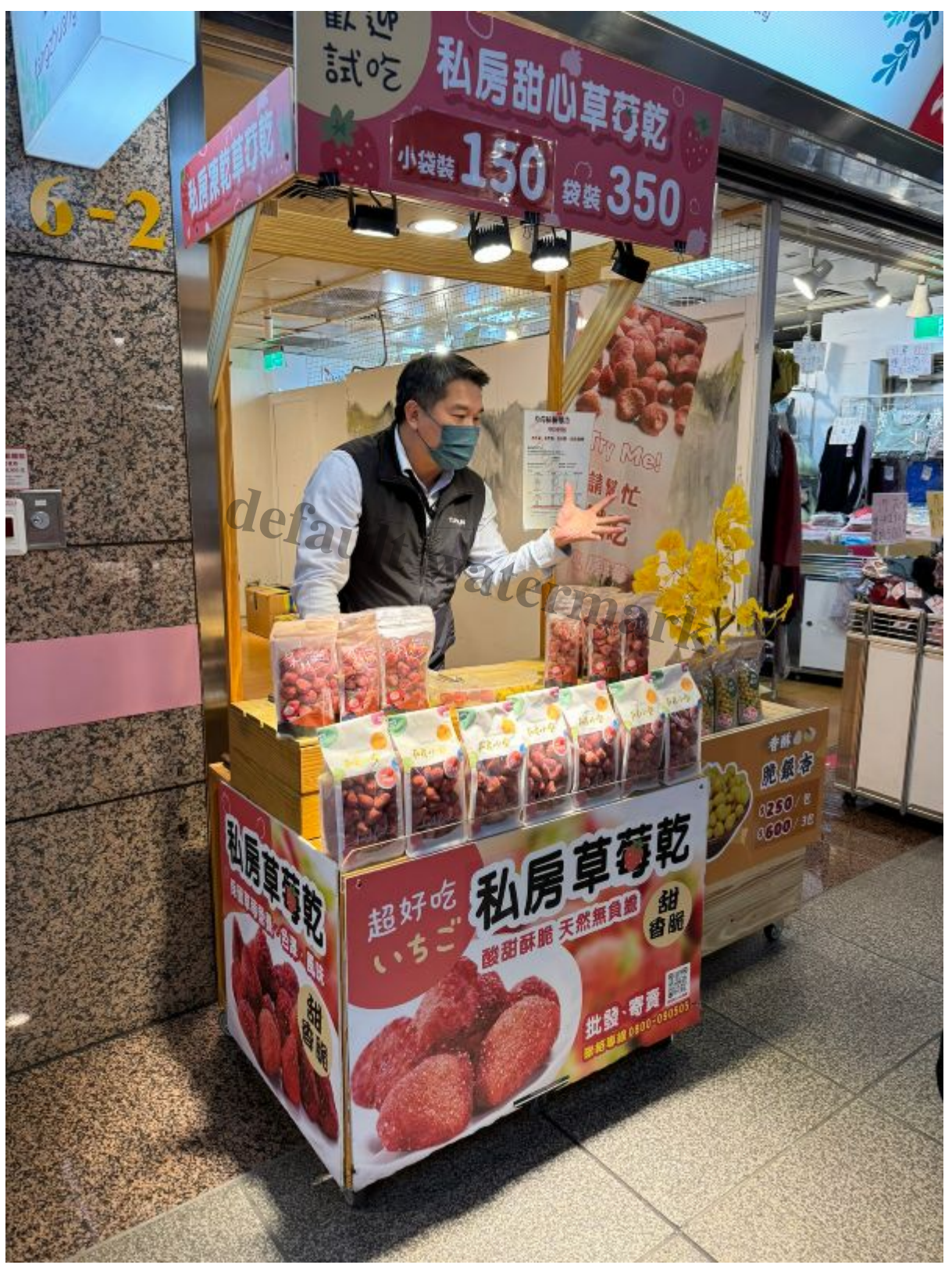
Dried strawberries are surprisingly tasty!