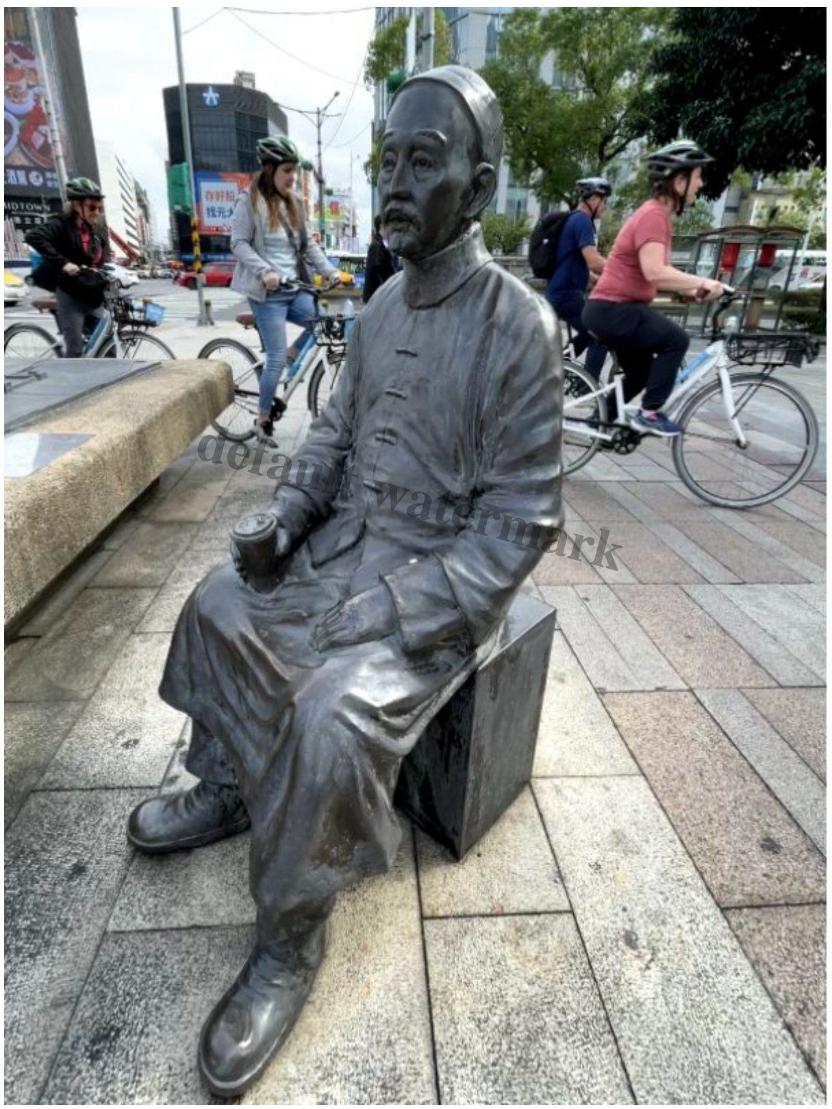
Statue of an early immigrant in Taiwan