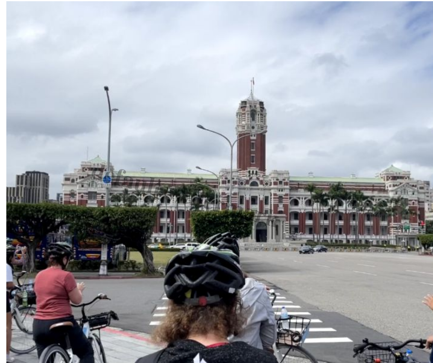
Presidential Office Building (���)