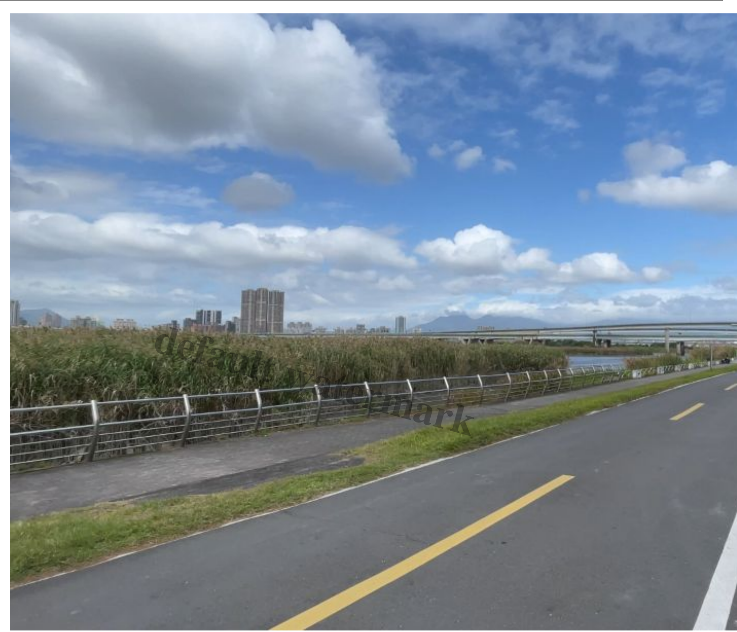
The cycling path is well-paved and connects numerous places of interest

This cycling path stretches along the Tamsui River for about 100 miles and it leads to Tamsui itself. Across the river is the New Taipei City accesible by several bridges and train lines. A great spot for enthusiast cyclists to fall in love with.