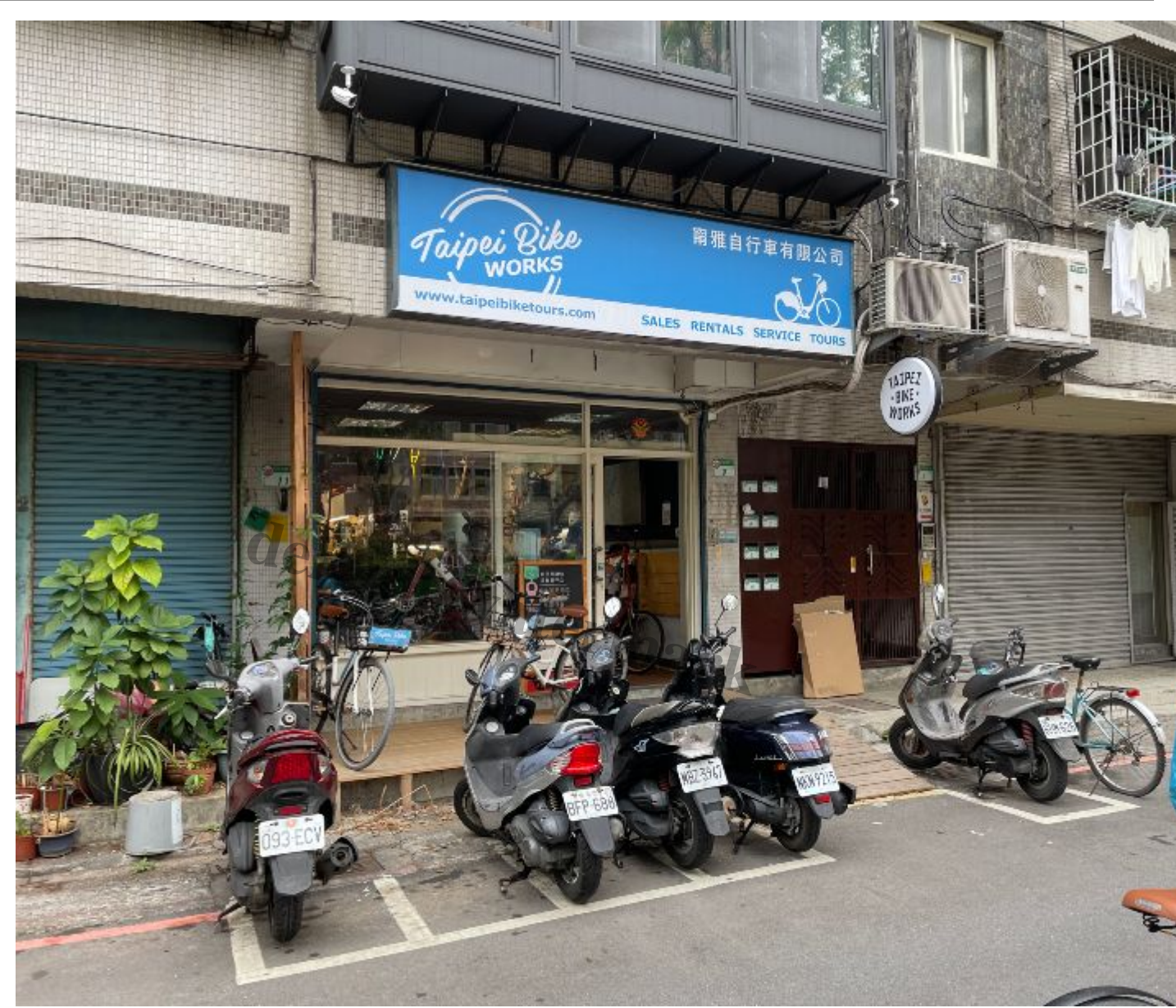
Taipei Bike Works | ç¶ä¿®/ä¿•é¤?å°?é??å°?/å?®è»?ç§?å??

Our starting point is at this bicycle rental/repair shop located just next to Chaoyang Tea Park. The route is about 8 miles or 13 kilometers. The guide planned for a 4-hour cycle through 4 districts, namely Datong, Zhongshan, Zhongzheng, and Wanhua. He gave a detailed brief of the functions of the bike and allowed us to get used to it by cycling around the park before setting off.