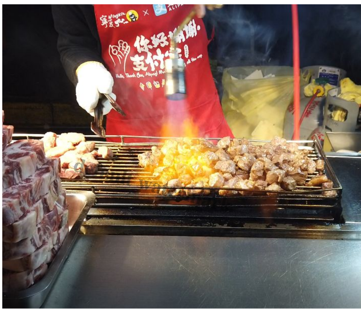
BBQ flame-torched beef cubes

The beef is quite fatty and tender to the bite. The grilled charred taste makes it a must-eat. I would have bought 2 portions if I had more space in my stomach.