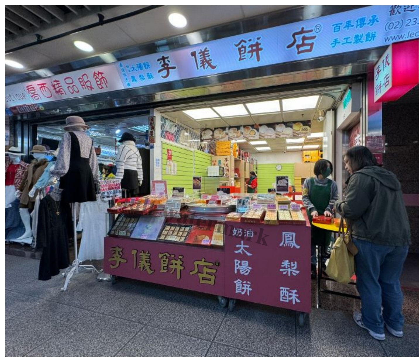
Pastry shop that sells the iconic suncake (太é?³é¥¼) and pineapple tarts (å?¤æ¢¨é¥)