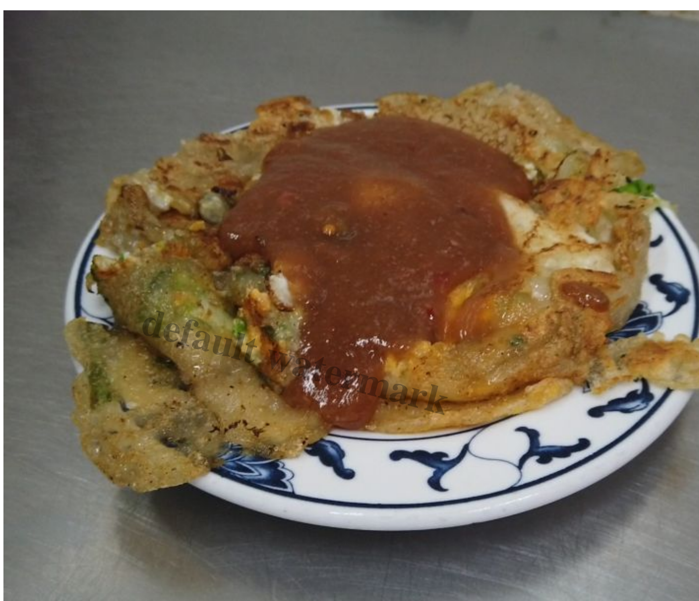
Egg Omelette with Oysters (é??è??è?µä»?ç ?ï¼?

The Omelette is softer and â??wetterâ?•, whereas it is fried with more charred here in Singapore, giving it a slightly crispy bite.