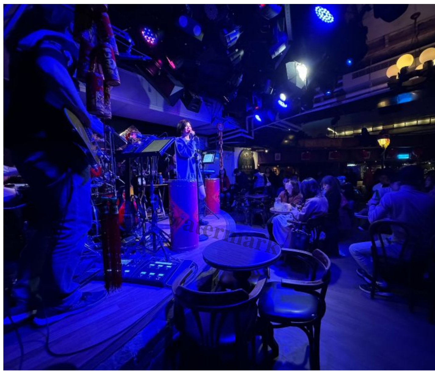
Various artists take turns performing well-known tunes and self-composed pieces