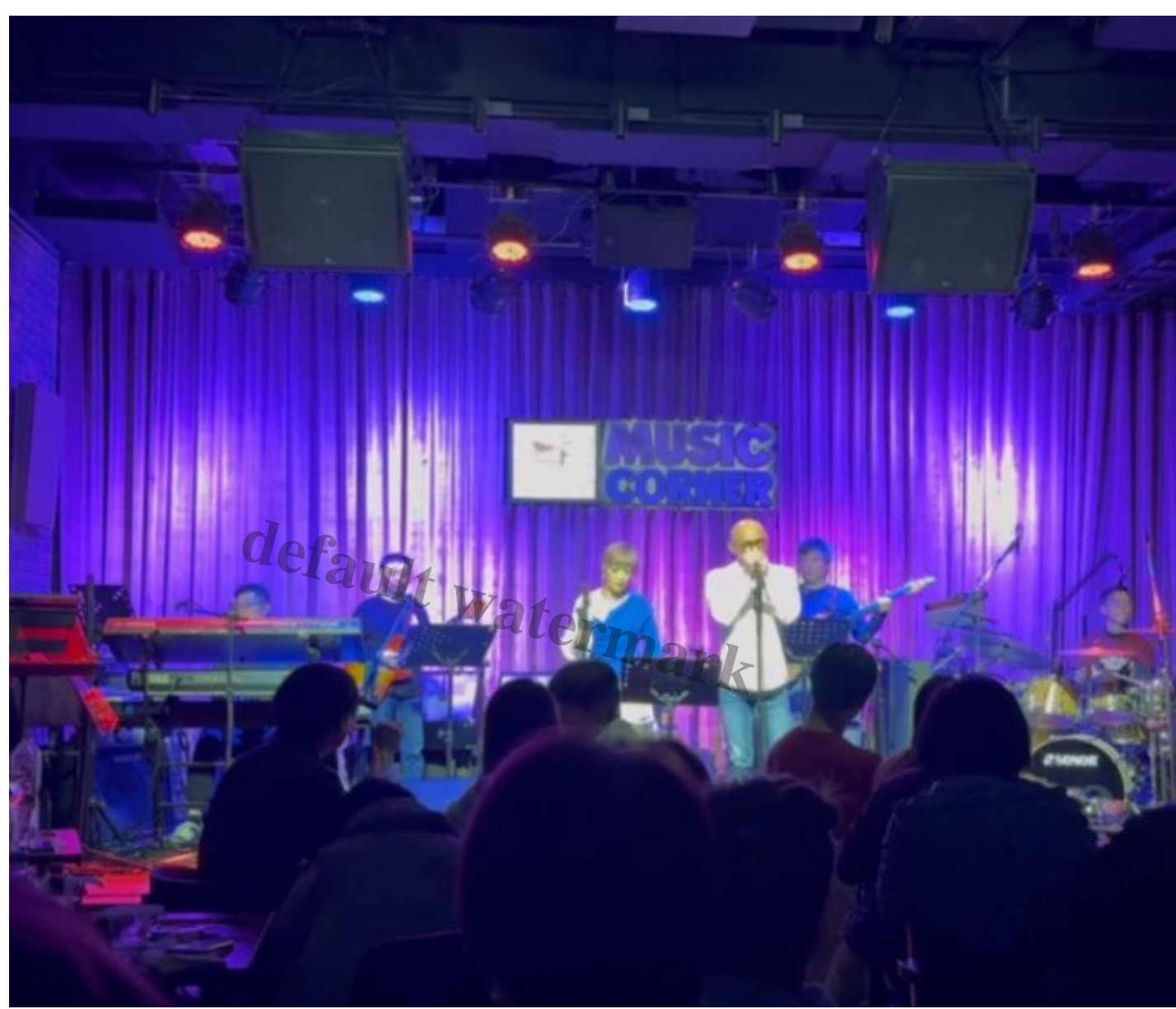
Music Corner (�蕽é?³æ¨?餕廳) â?? the songs performed are relatively mature and classic

I would recommend calling in advance to book your seats. Both joints were swiftly filled with guests shortly after my arrival. After a few drinks, you will surely hear some familiar songs to sing to. At least I did :D.