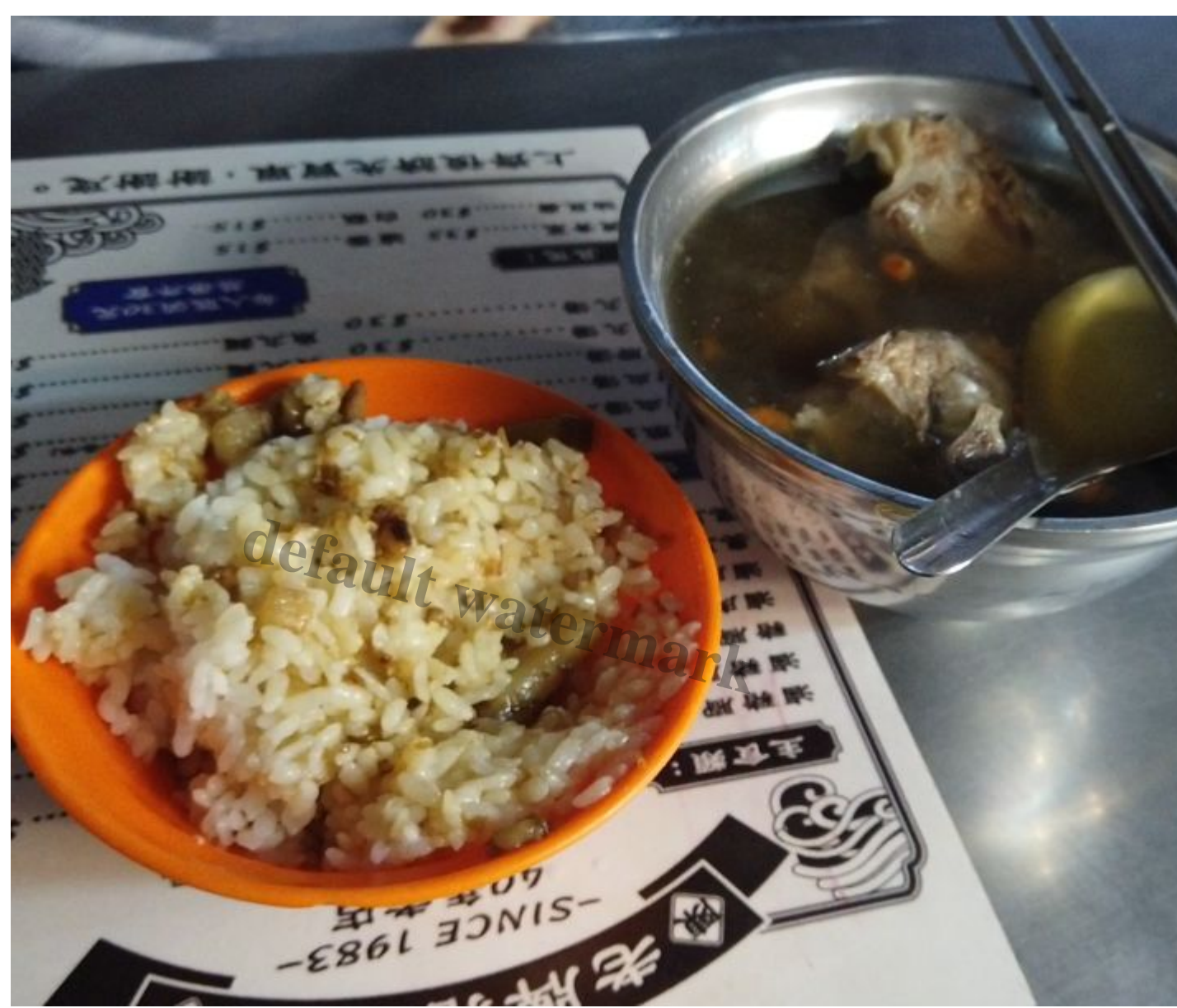
Lu Rou Fan (啤è??é¥) and Pork Ribs Soup (æ??é<sup>a</sup>·æ±¤)

The braised pork rice is a common dish and a very simple one as well. It is plain rice mixed with some braised minced pork. Paired with a freshly boiled pork ribs soup at 16 degrees temperature is truly satisfying.