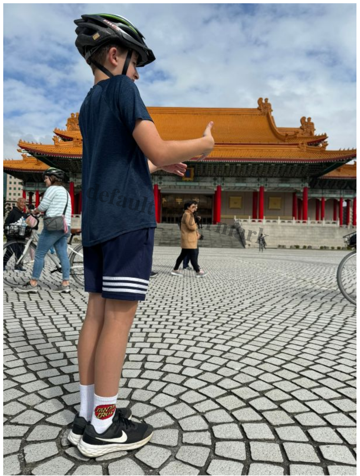
Clap your hands at this spot and hear what happens!

An interesting phenomenon at Liberty Square located just about 100 metres from the memorial hall, is the spot where this young boy is standing. When you stand on that spot (and nowhere else) and clap your hands, it produces a squeaky pingy sound instead of your usual clapping sound. Is it the distance from the surrounding architecture? Or is some kind of magnetic field produced from the metal below the