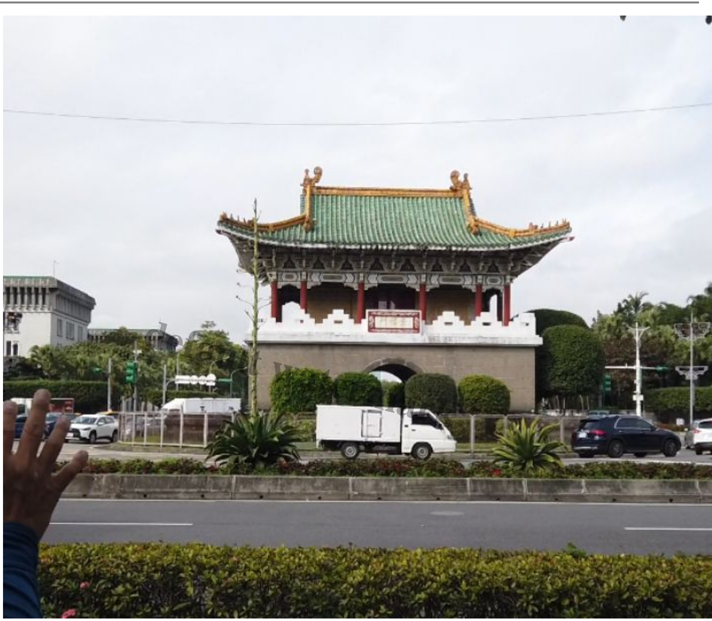
Taipei East Gate (JingFu Gate)

One of the 5 historic gates in Taipei is the Taipei East Gate or æ?<sup>-</sup>çl•é?". It was constructed in 1884 by the Qing government as a measure to expedite urban development by encouraging businessmen to invest in or build houses/streets in Taipei City.