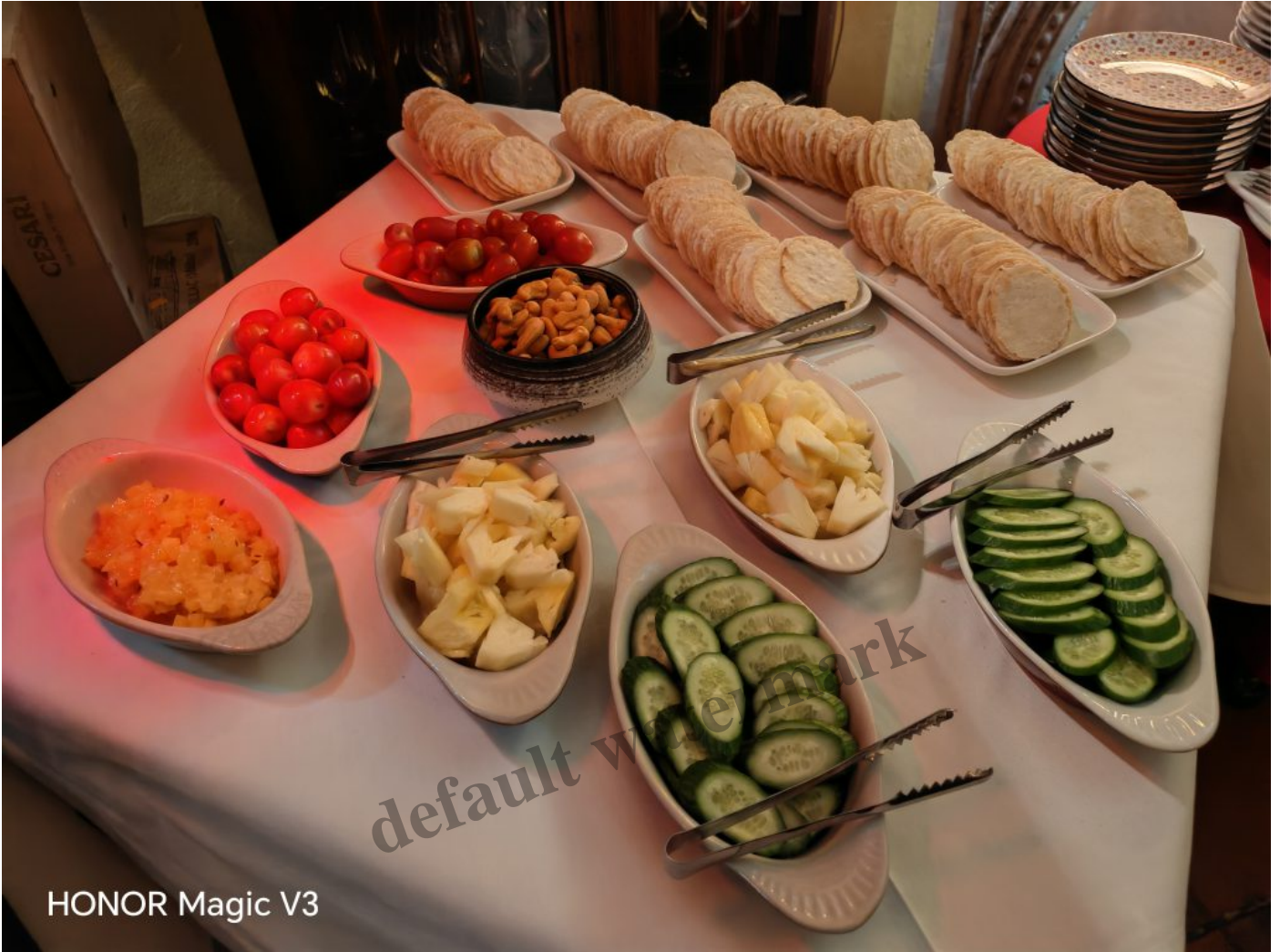
The word Singapore spelt out in cheese.