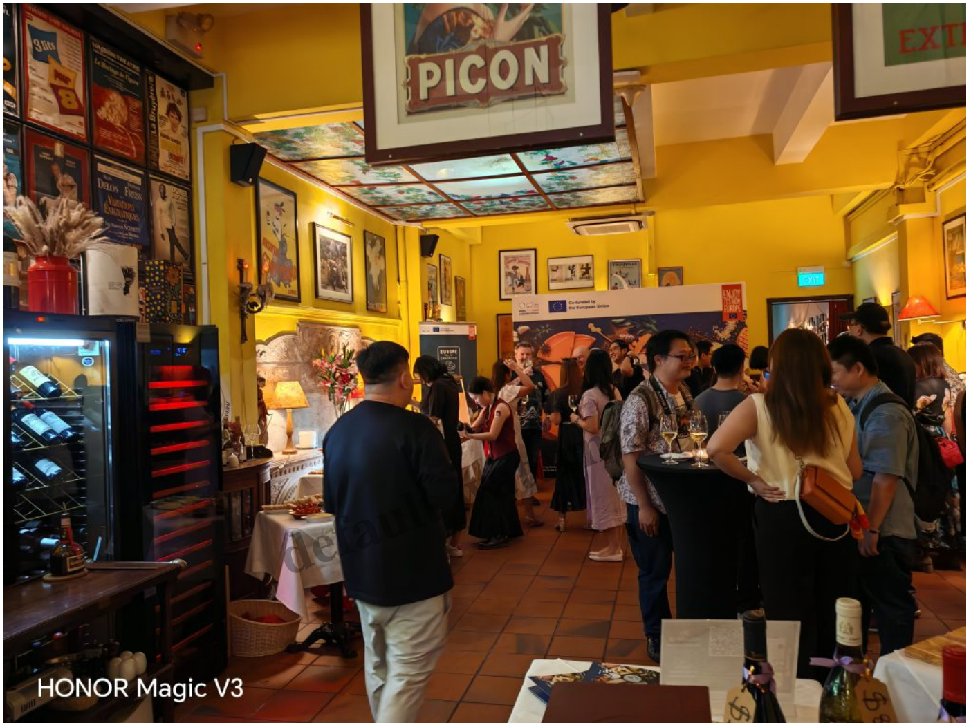
HONOR Magic V3

The restaurant looks nice, right? It is like a mishmash of posters on supposedly gawky-looking yellow walls but it somehow adds character to a place.