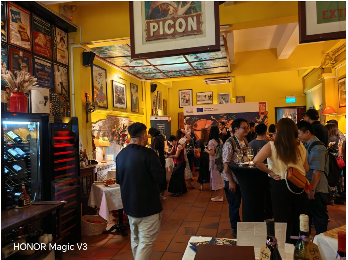
HONOR Magic V3

The restaurant looks nice, right? It is like a mishmash of posters on supposedly gawky-looking yellow walls but it somehow adds character to a place.