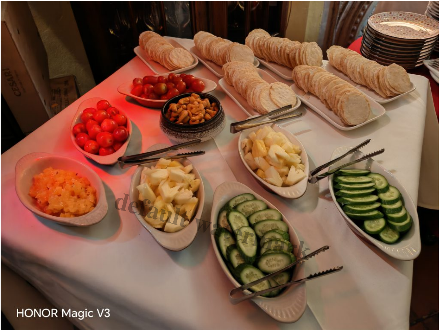
The word Singapore spelt out in cheese.