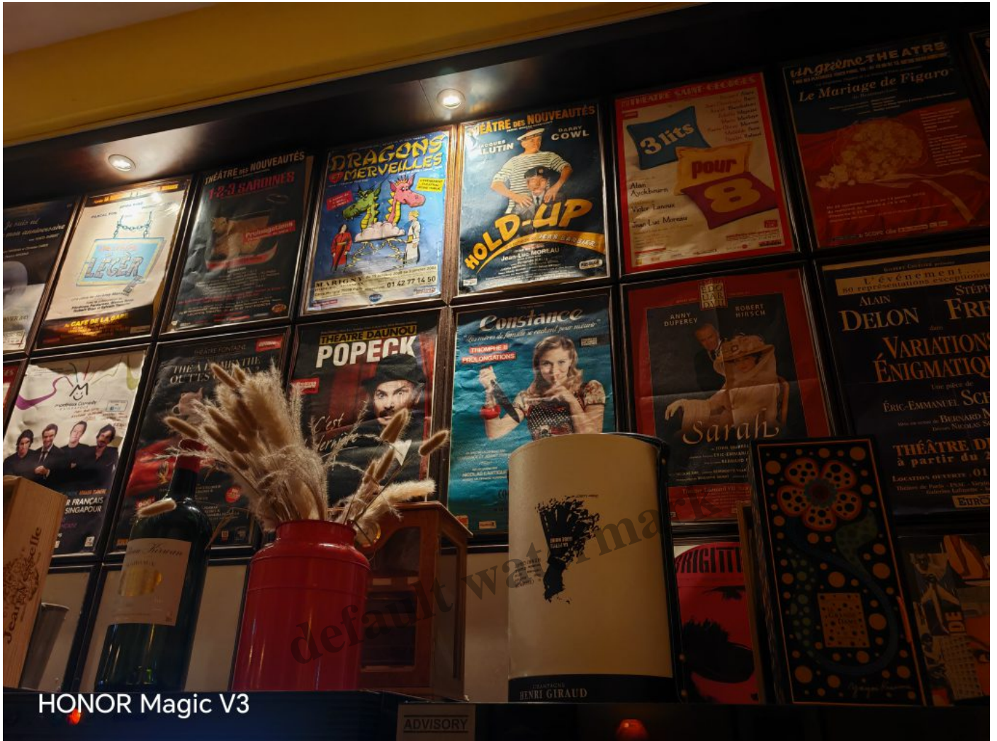
HONOR Magic V3