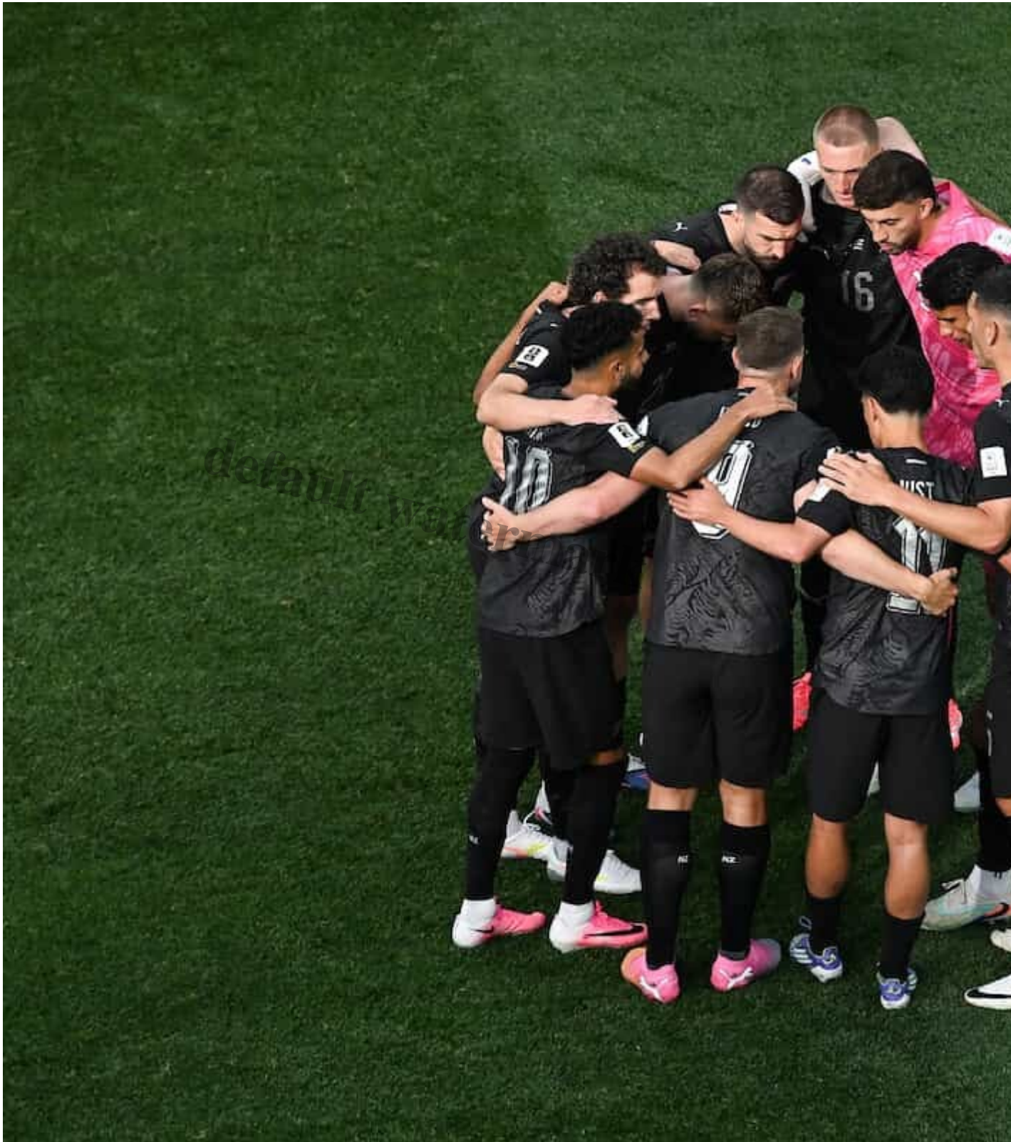
The All Whites headed into the 2026 World Cup with genuine hope, but a tough Group G draw leaves them needing a result against Belgium.