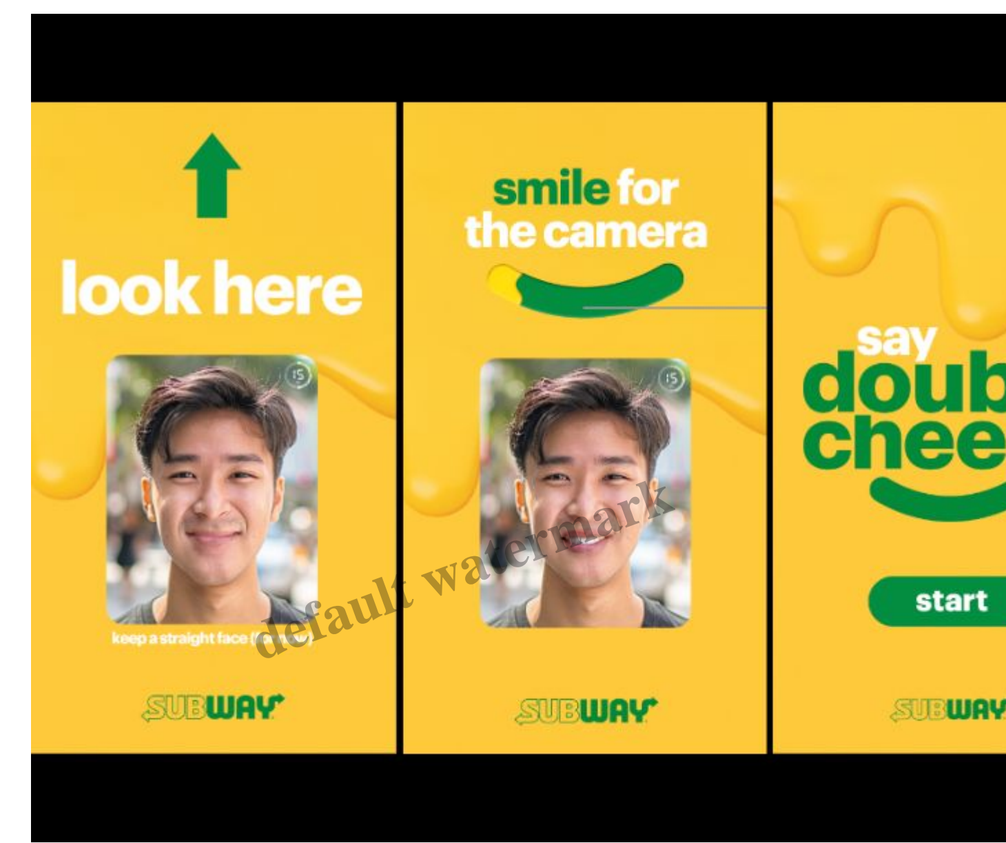
Subway® 'The Double Cheese Challenge' Kiosk: Double your Smile with a Free Double Cheese Chi

For the first time, Subway® Singapore will be launching 'The Double Cheese Challenge' kiosk to bring joy and double the smile on your face amidst your busy lifestyle.