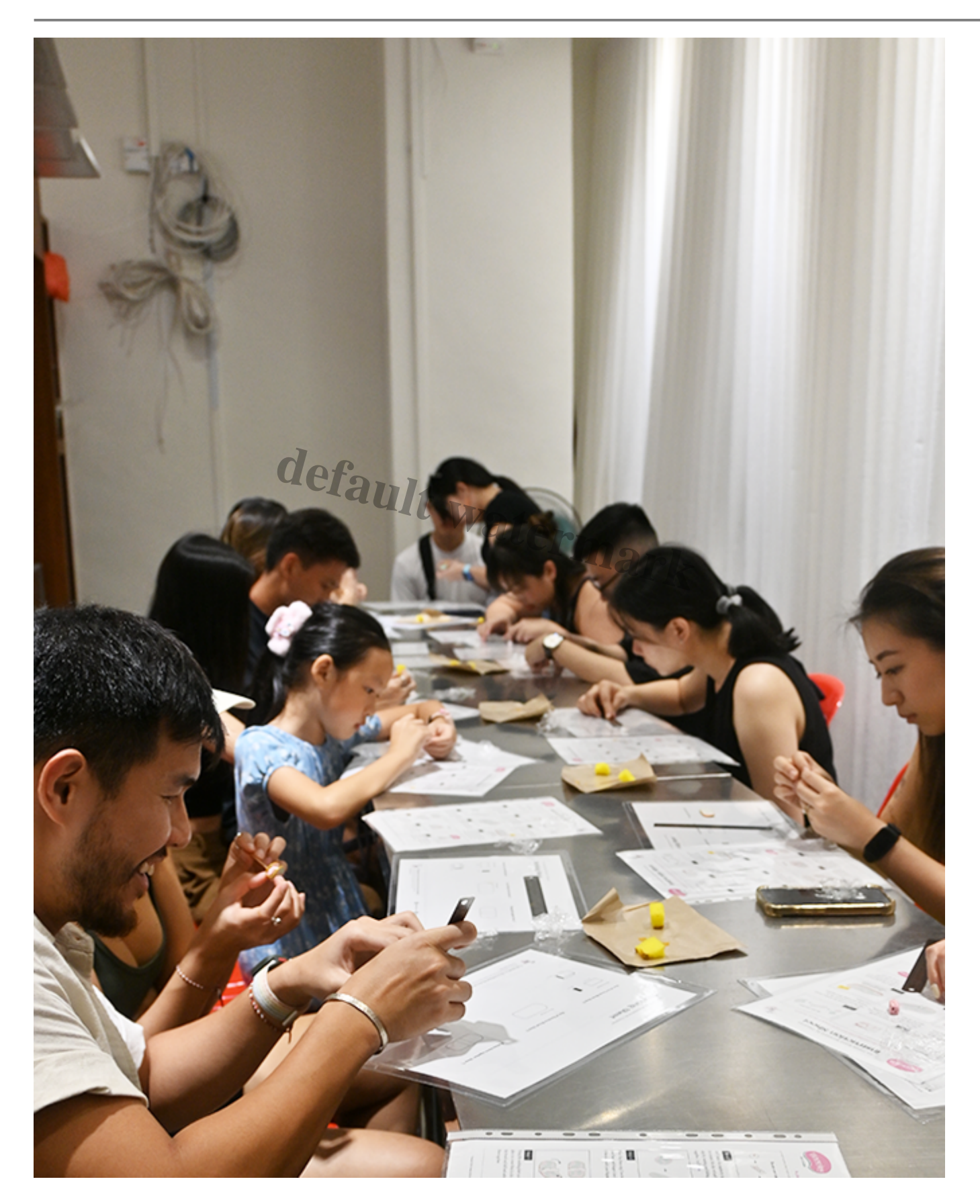
Festive Ornament Workshop with Tinysnips Sunday, 8 December 2024