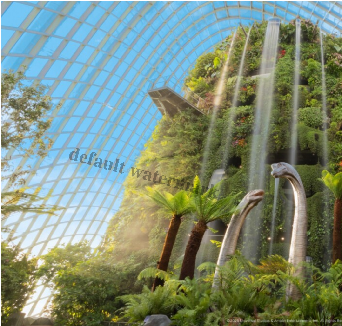
Jurassic World: The Experience brings life-sized dinosaurs into Cloud Forest.

Gardens by the Bay describes the event as an immersive walk-through inspired by the Jurassic World film franchise, presented with NEON and Universal Live Entertainment. Highlights include an 8.5m-tall Brachiosaurus and a face-to-face moment with a Tyrannosaurus rex.