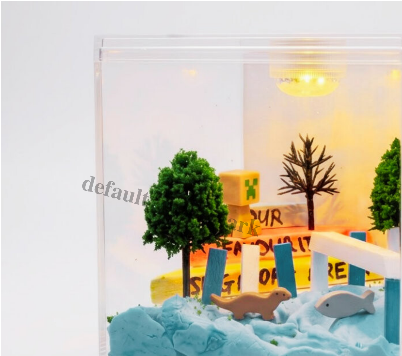
From Foul to Fresh workshop visual.