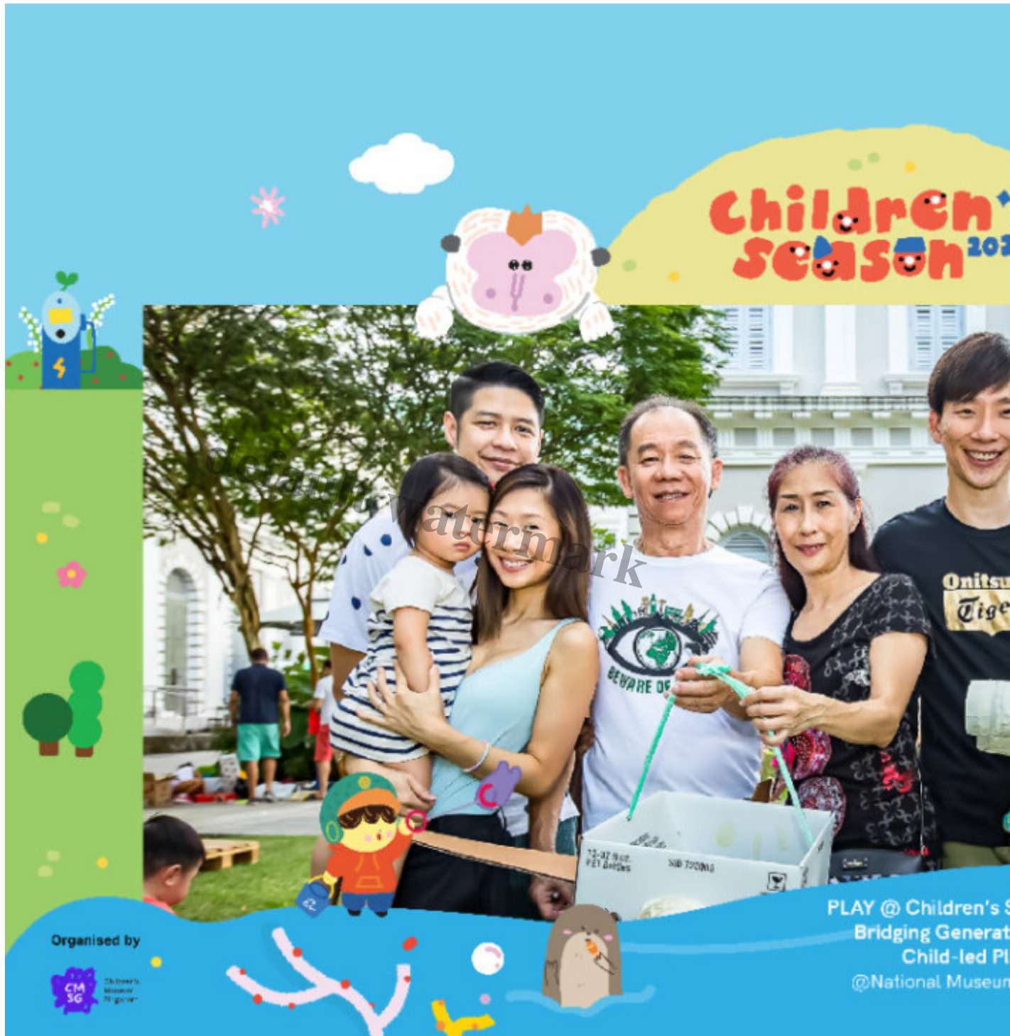
PLAY workshop visual for Children's Season 2026.