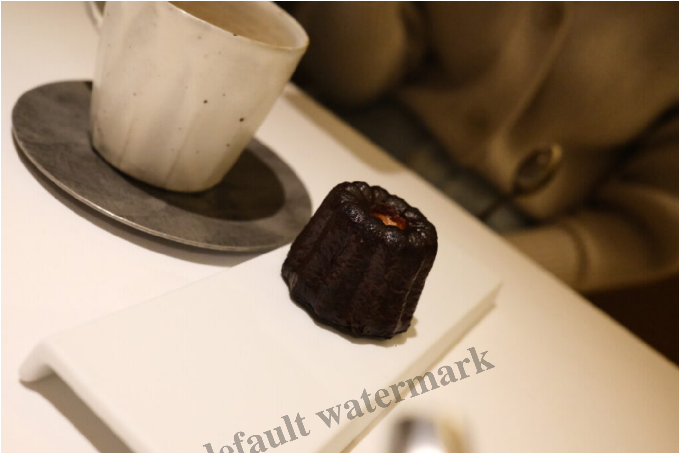
A gift from the chef after our meal.