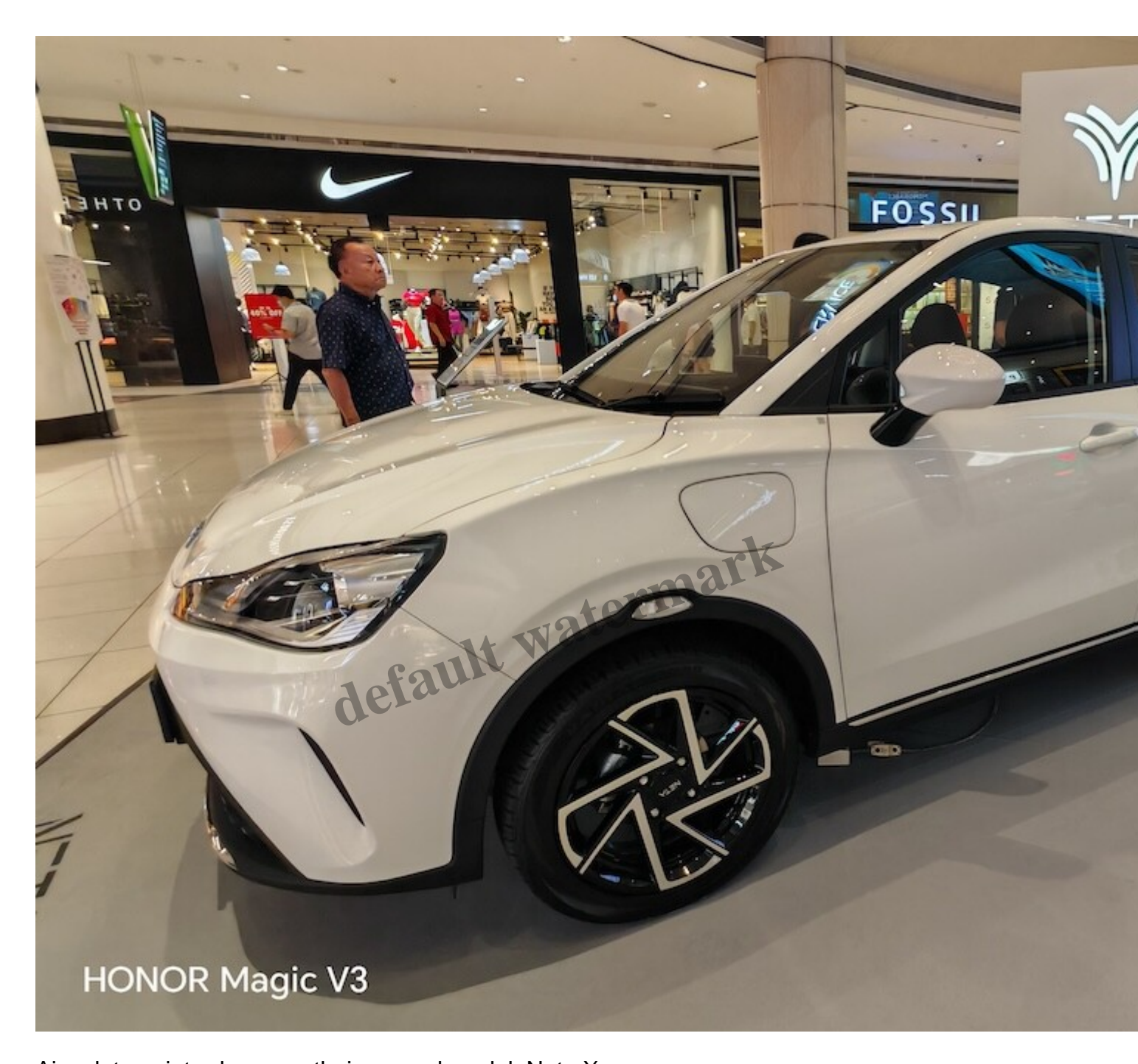
Aiya, let me introduce you their second model, Neta X.