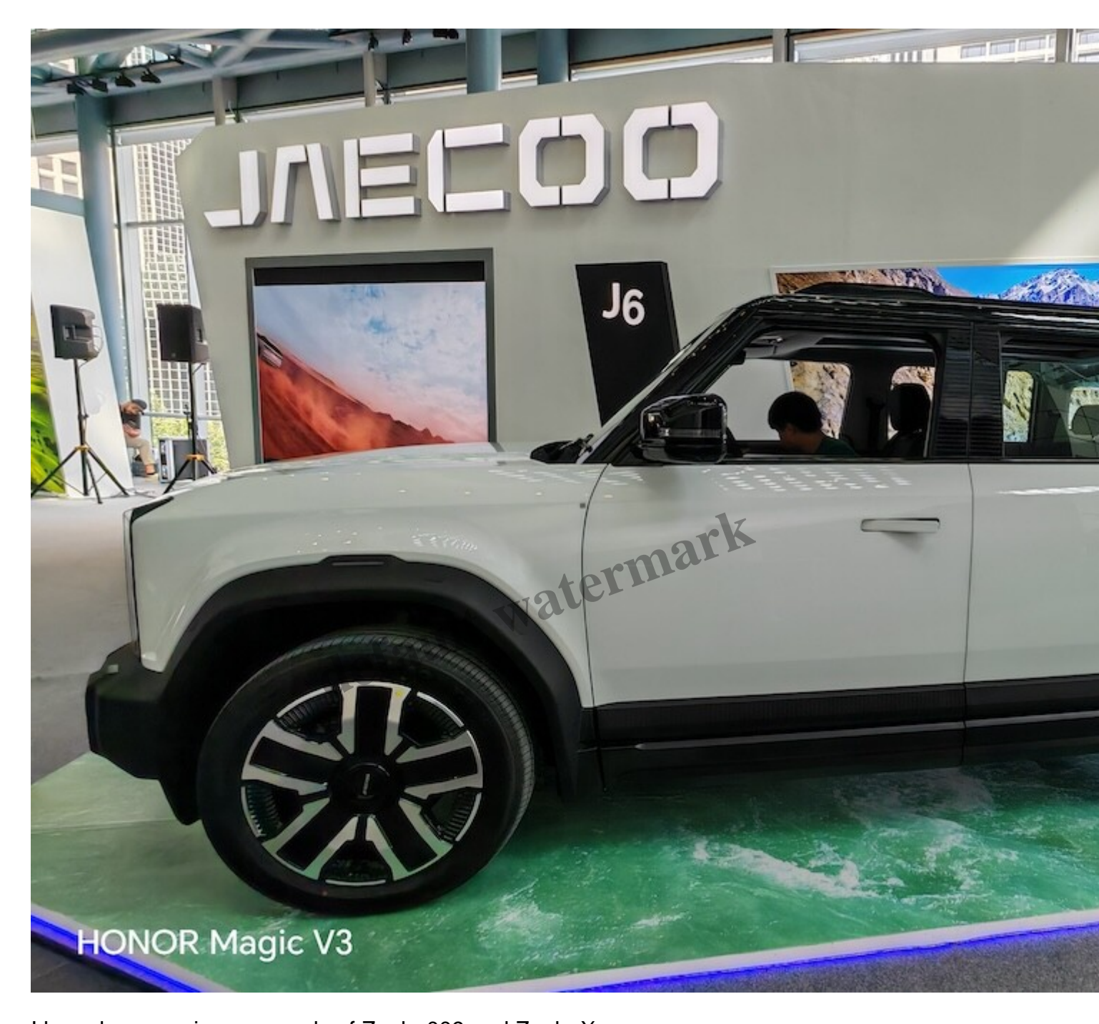
I have been seeing many ads of Zeekr 009 and Zeekr X.