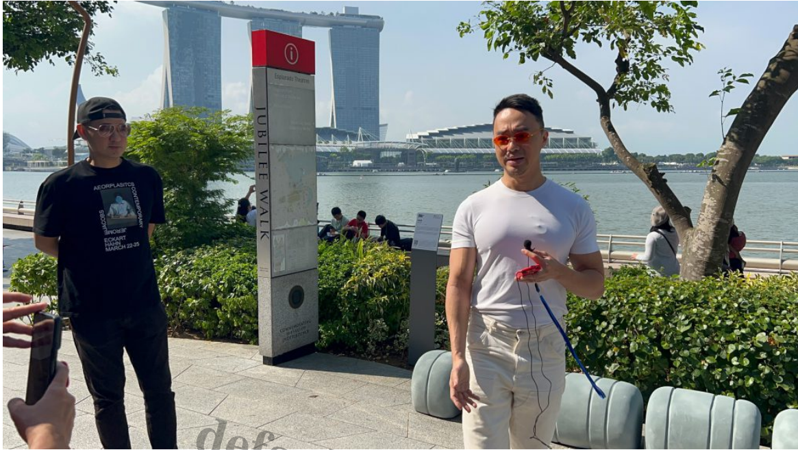
The artists were there to present their works.

I must say that despite the sweltering heat of the mid-day sun, a walk along the Civic District is still very pleasant. I never would have imagined that there could be so many people, especially tourists, roving around the Civic District on a weekday afternoon! There were loads of stares at this large group of people moving around, taking photos of seemingly inconspicuous benches.