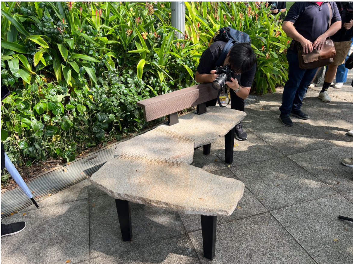
I have no idea who was that guy.

I must say that despite the sweltering heat of the mid-day sun, a walk along the Civic District is still very pleasant. I never would have imagined that there could be so many people, especially tourists, roving around the Civic District on a weekday afternoon! There were loads of stares at this large group of people moving around, taking photos of seemingly inconspicuous benches.