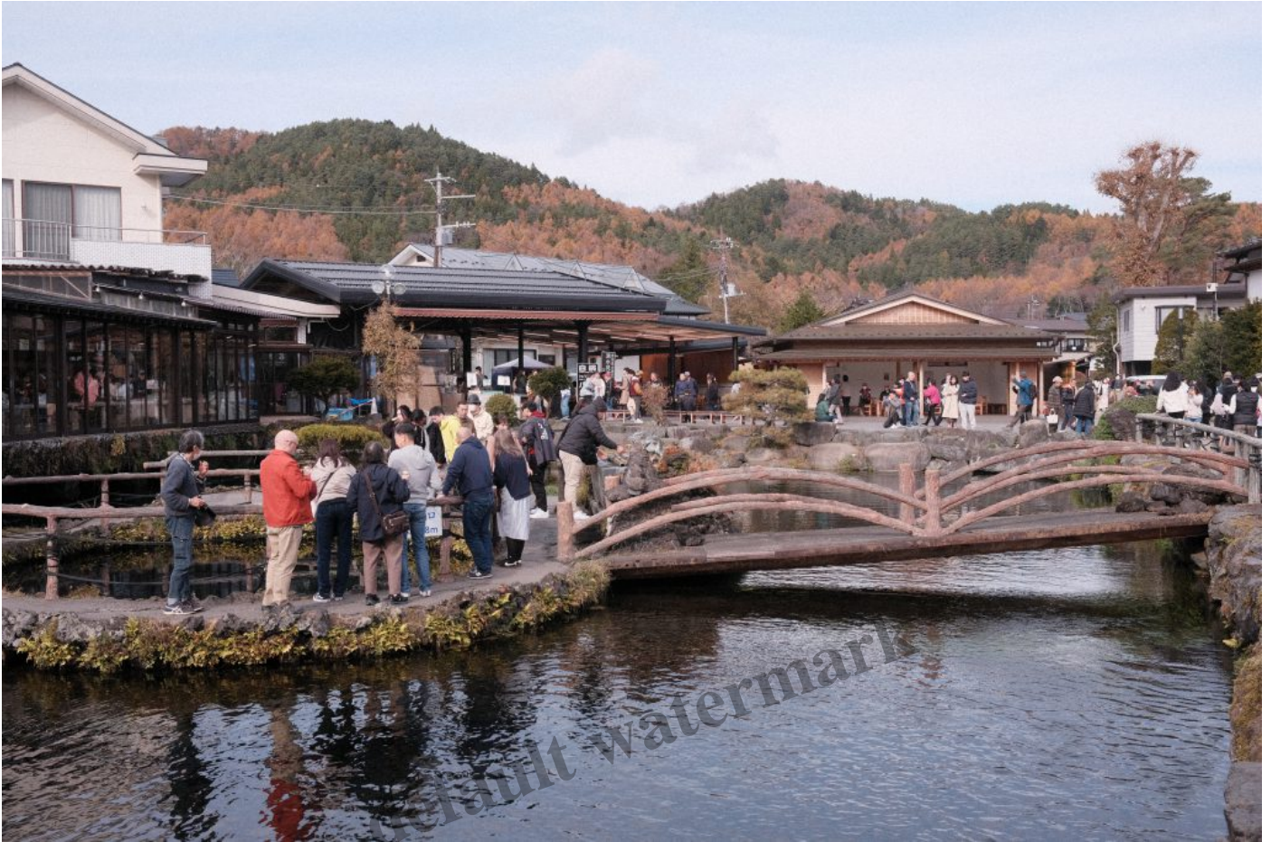
Lunch at Sanrokuen