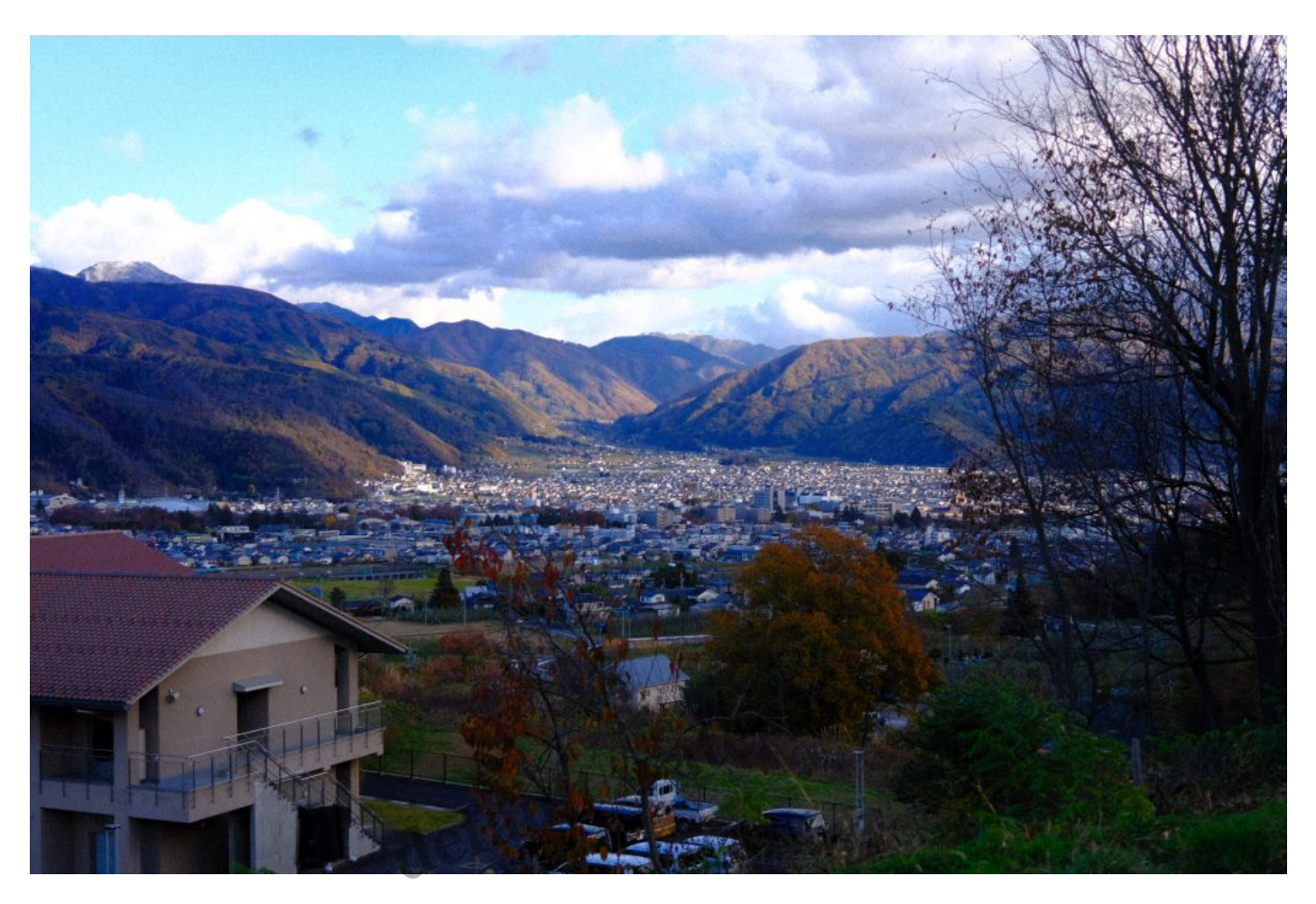
Light Snacks before Dinner: Matsumoto Karaage Center