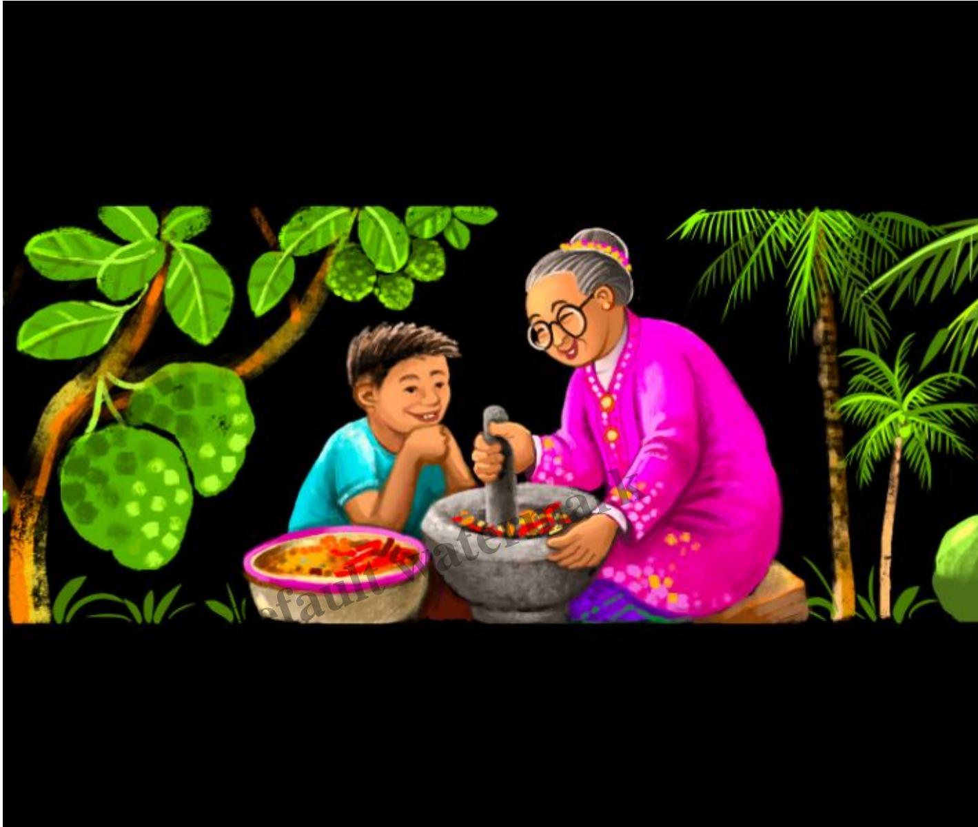
Artist's impression of the façade artwork. Courtesy of Yip Yew Chong

Peranakan Museum comes alive with Singaporean artist Yip Yew Chong's first foray into digital animation and projection mapping, as he lights up the façade with Mari Kita Makan . As an extension of his captivating and nostalgic murals across Singapore, Mari Kita Makan is a visual storytelling of a Peranakan feast. Audiences will be enchanted by a Nyonya and her grandson bonding as they mix spices and herbs, joyous scenes of a multicultural tok panjang (long table) family dinner, and the sharing of Peranakan kuehs (sweet and savoury snacks) to end the meal.