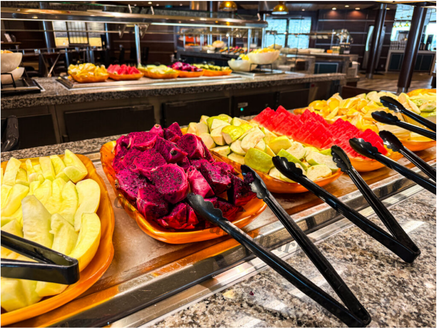
The fruit selection is huge, better than some hotel buffets.