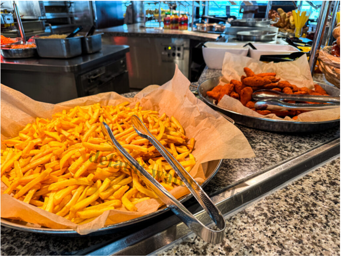
This is definitely the most popular spot with high turnover rate.