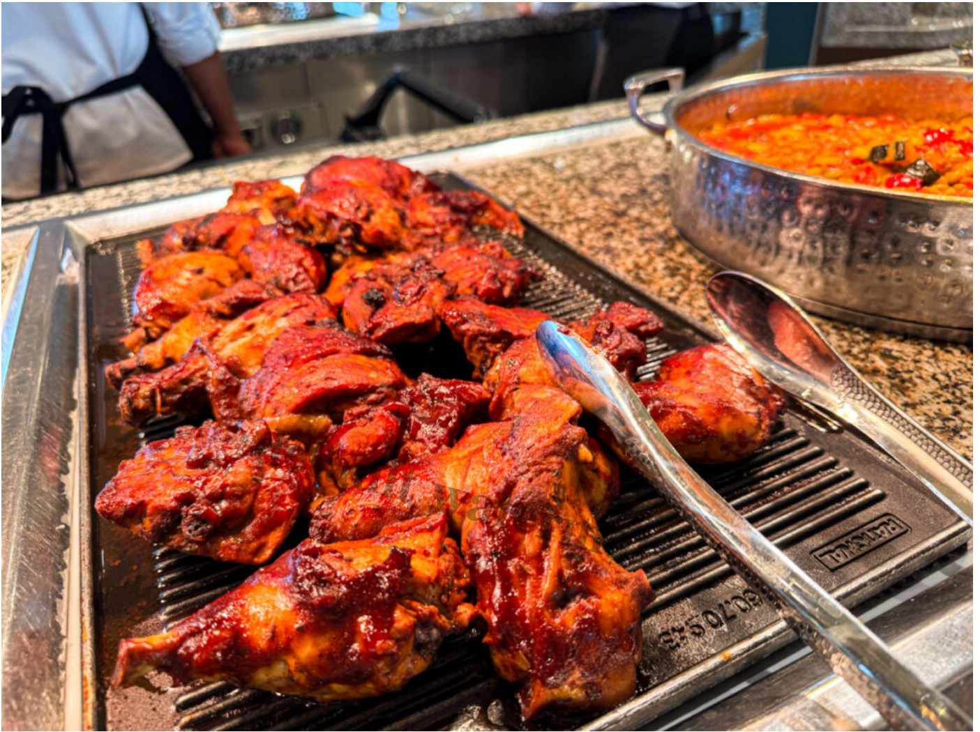
Grilled Chicken looking good as always.