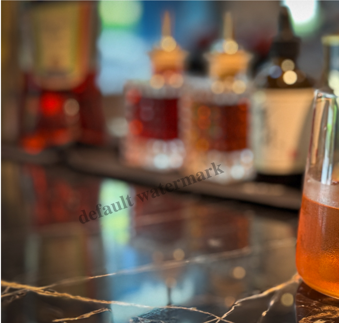
Earthly Paradise (S$28) – Made with Pisco, Umami Vermouth (Abalone Brine), Spiced Bitters

A cocktail made with abalone brine. Who would've thought?