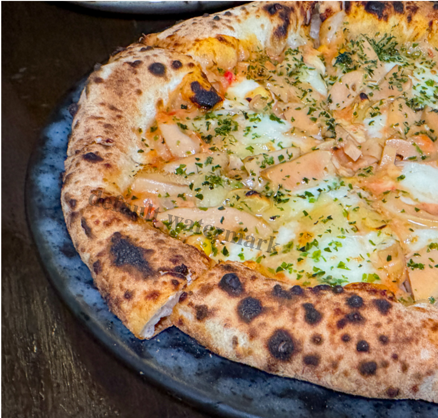
Abalone Chowder Pizza (S$30) â?? Abalone, Mozzarella, Abalone Chowder White Sauce, Seaweed