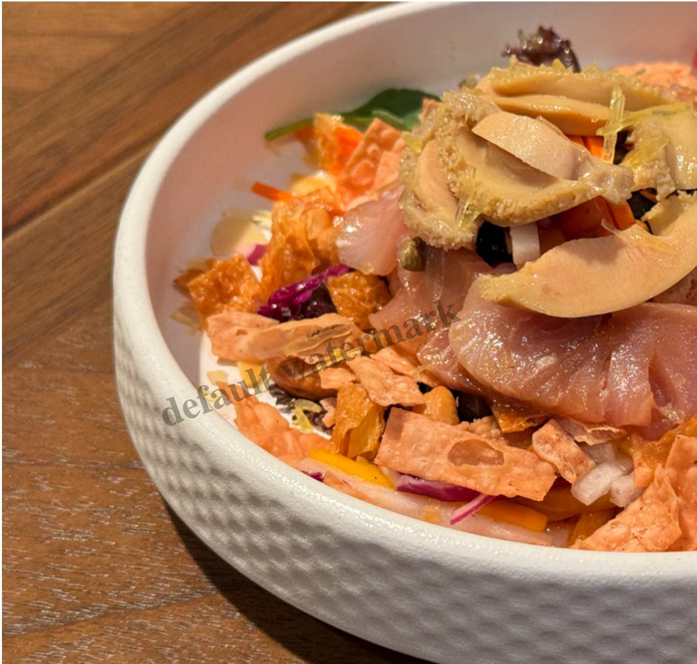
Sour Plum Calamansi Abalone Salad (S$32) – Abalone, Yuzu Soy Hamachi, Nuts & Crunch, Season

And then there's Jiak Kim House , serving up Asian fusion in a cool old building (it used to be Zouk!):