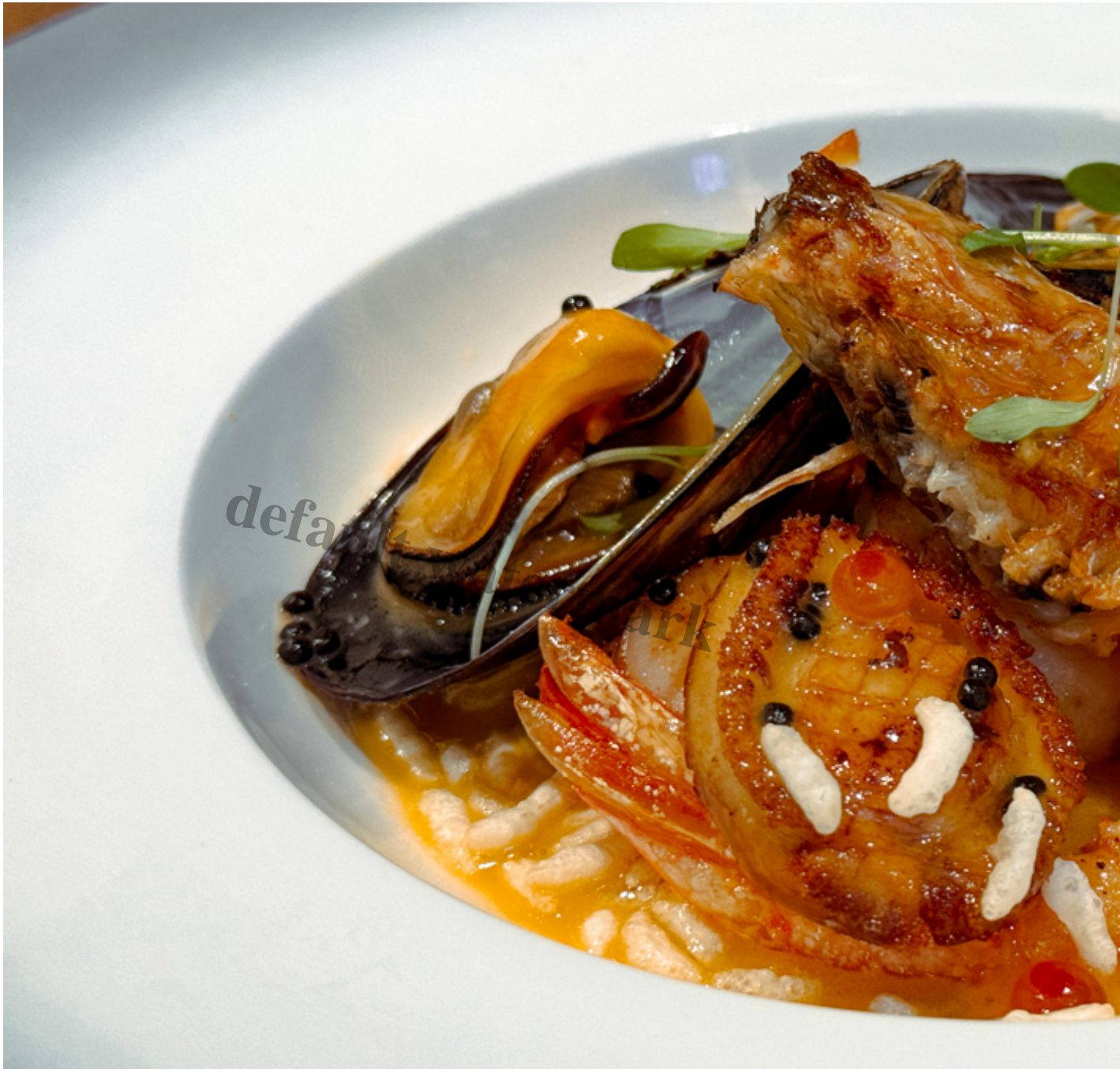
Herbal Dashi Seafood Beurre Blanc (S$48)- Roasted Abalone, Fresh Seafood, Angelica Root, Puffe

Enjoy the roasted abalone with a different texture!