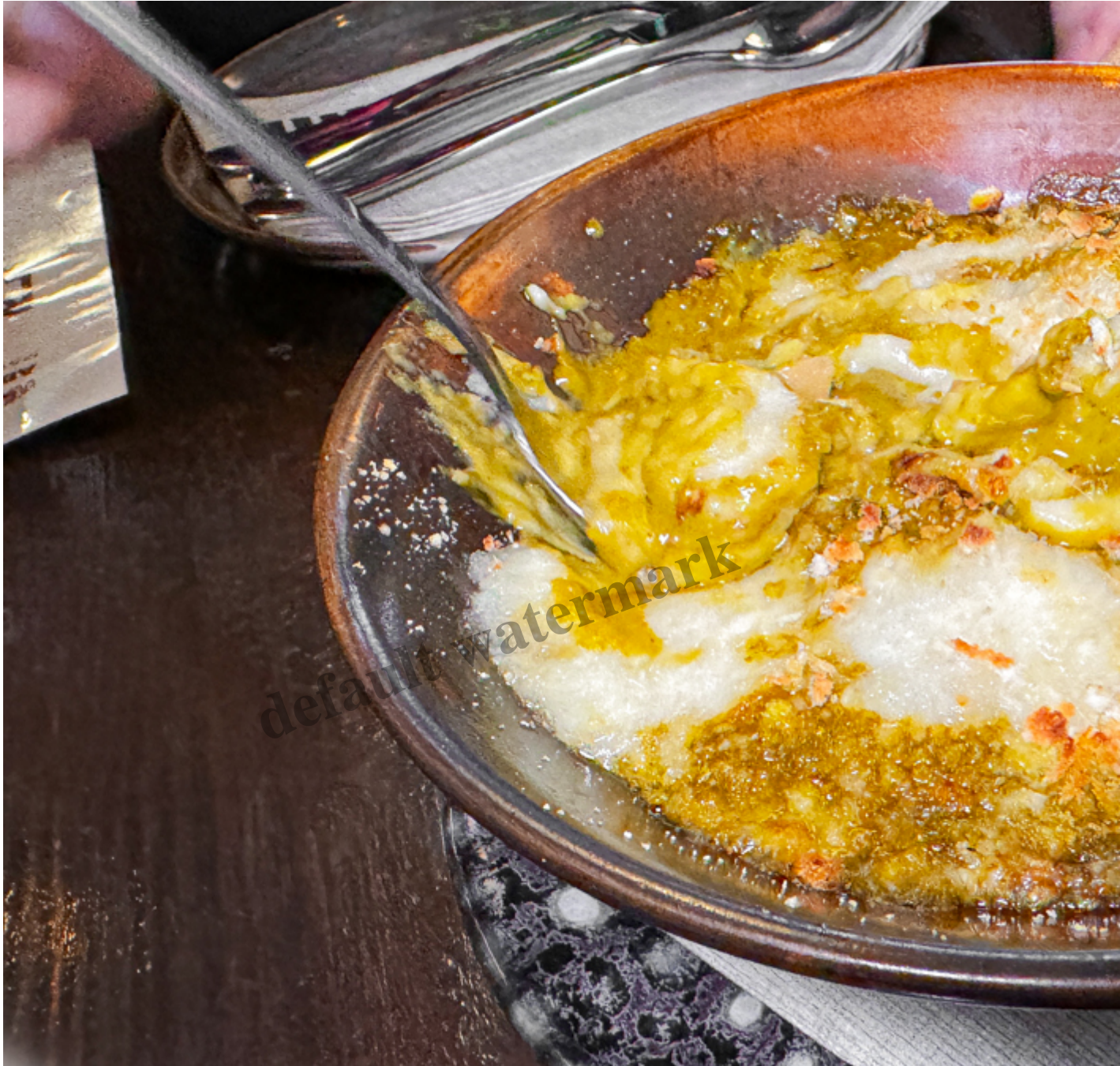
Abalone Gratin (S$24) – Abalone, Abalone Liver White Sauce, Mashed Potato Parmesan