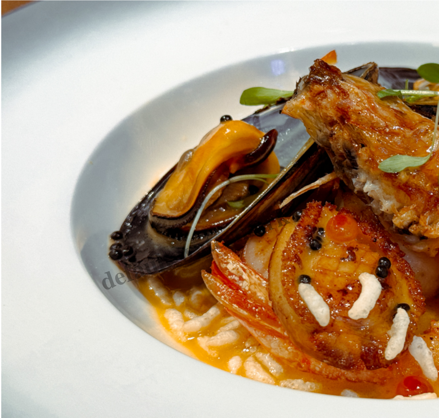
Herbal Dashi Seafood Beurre Blanc (S$48)- Roasted Abalone, Fresh Seafood, Angelica Root, Puffe

Enjoy the roasted abalone with a different texture!