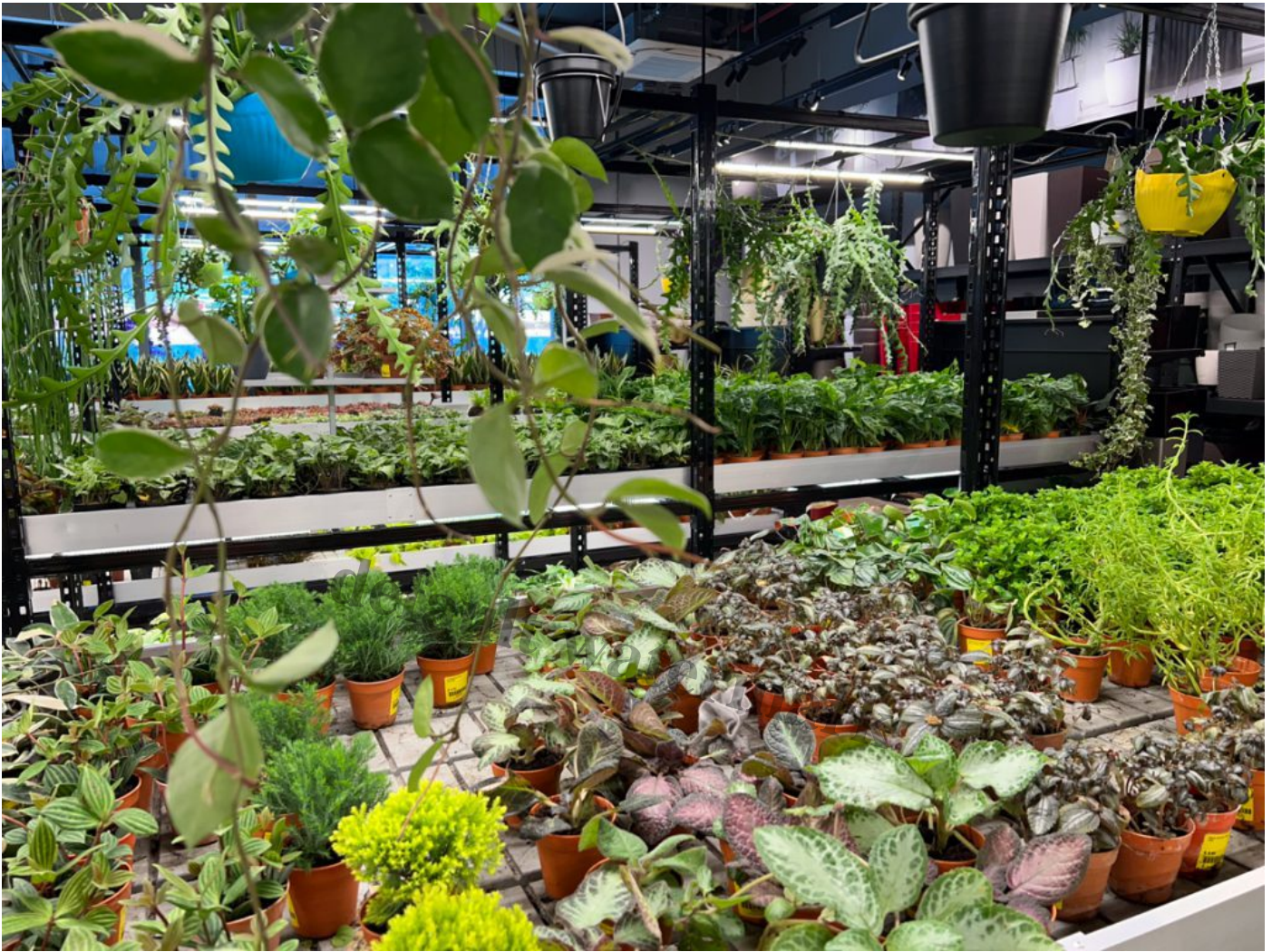
All this was in a comfortable, air-conditioned setting.