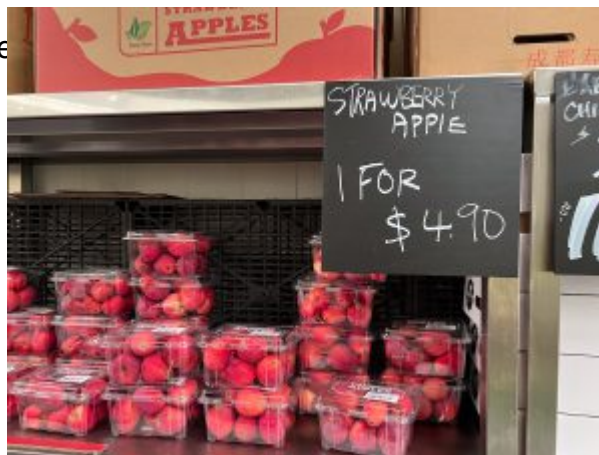
are in a cold room.