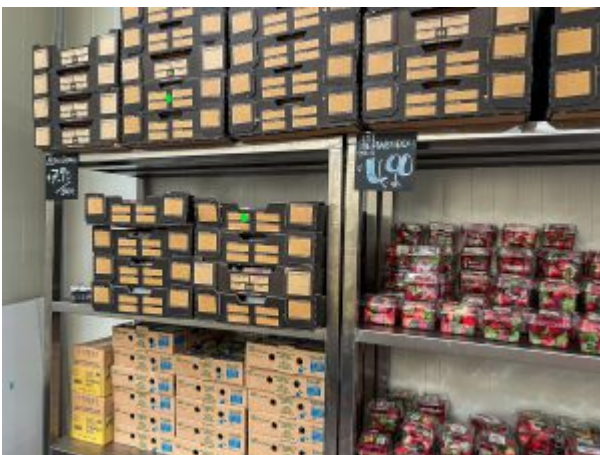
Level 2 houses the wholesale market.