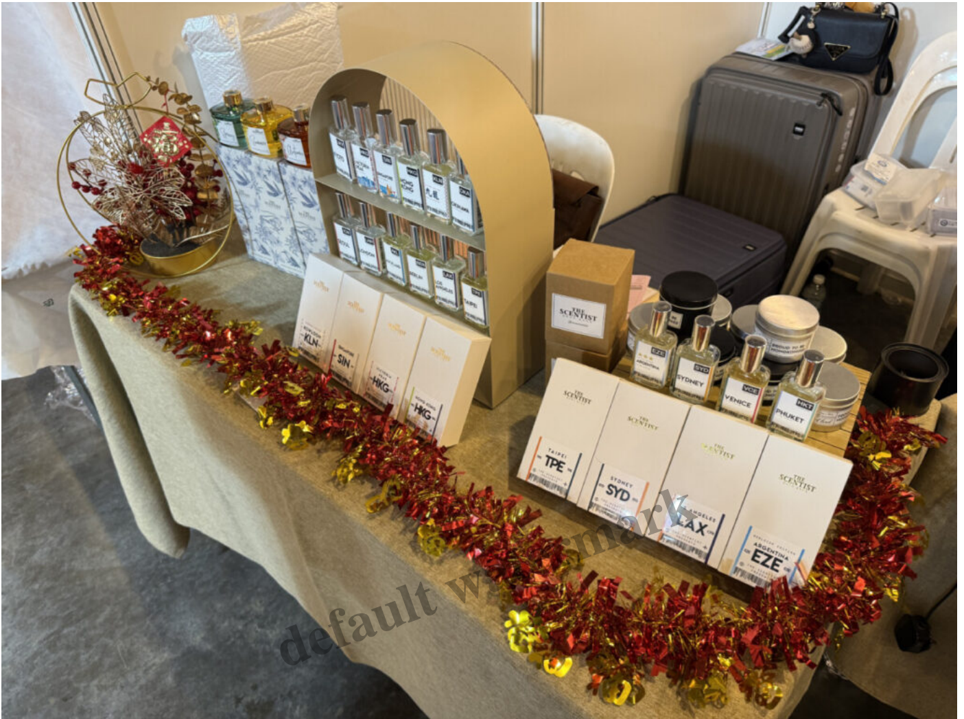
Apparently there is a Singapore scent.